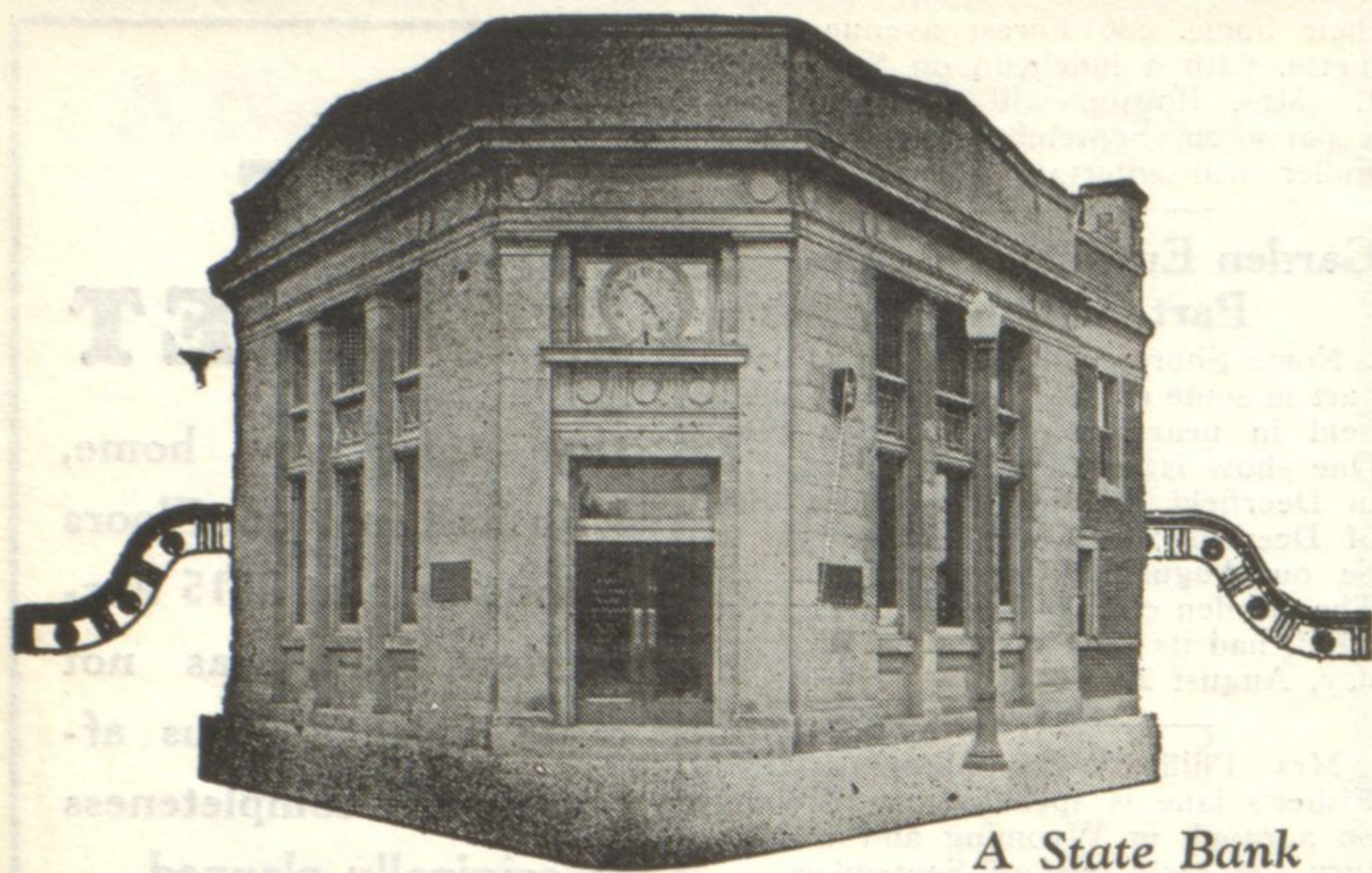
A State Bank