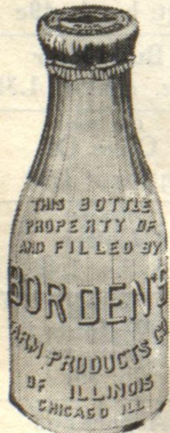
17 1/2 a Quart

Identify by this Trade Mark on the Hooded Cap