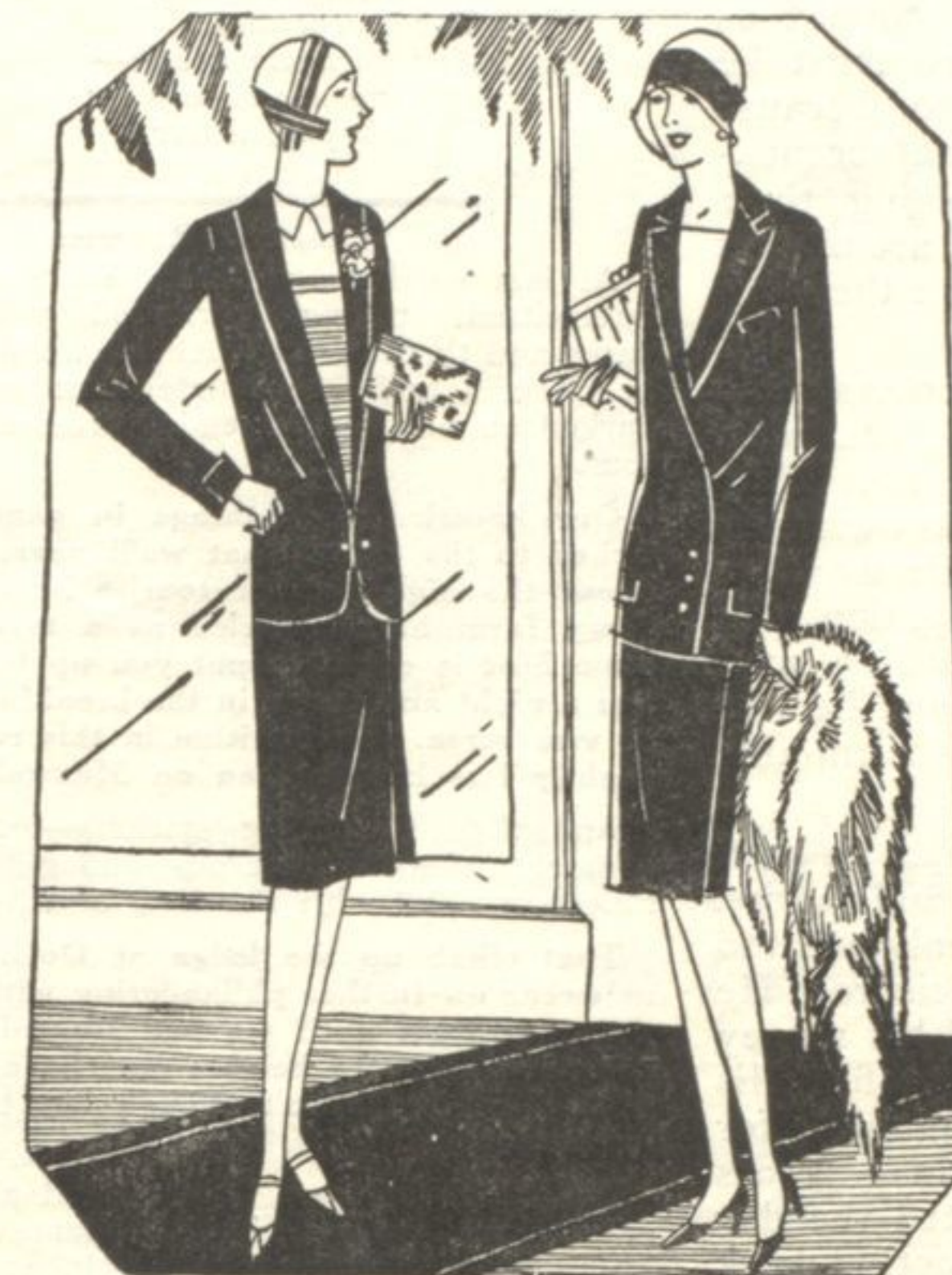
All Sales Final

—Many other styles and materials, but only one of each. We advise an early selection!