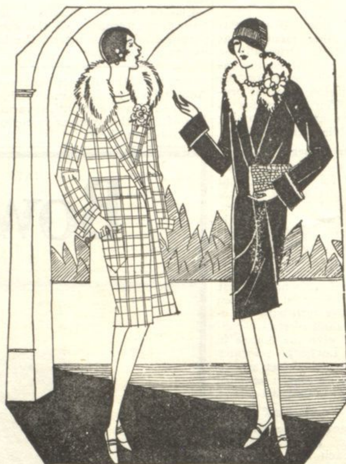
All Sales Final

DRESS coats from our higher priced groups—tailored ensembles—two-piece suits—Every suit and coat that remains in stock from our spring and early summer season must be cleared NOW.