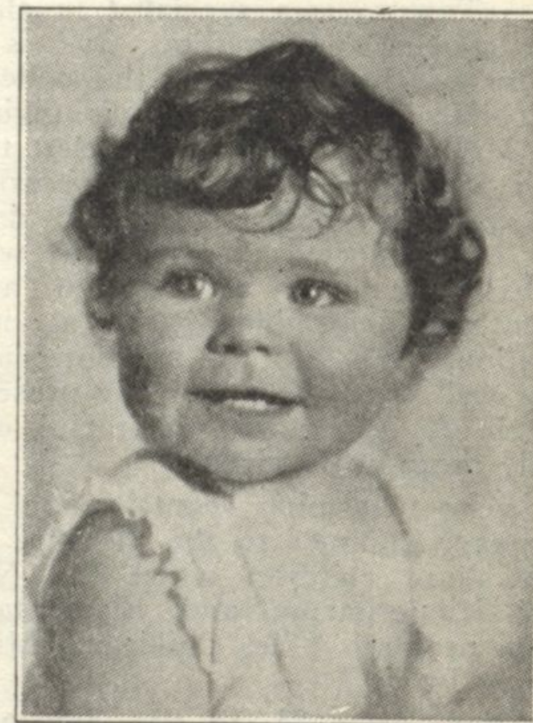
All Children Smile for Bernie