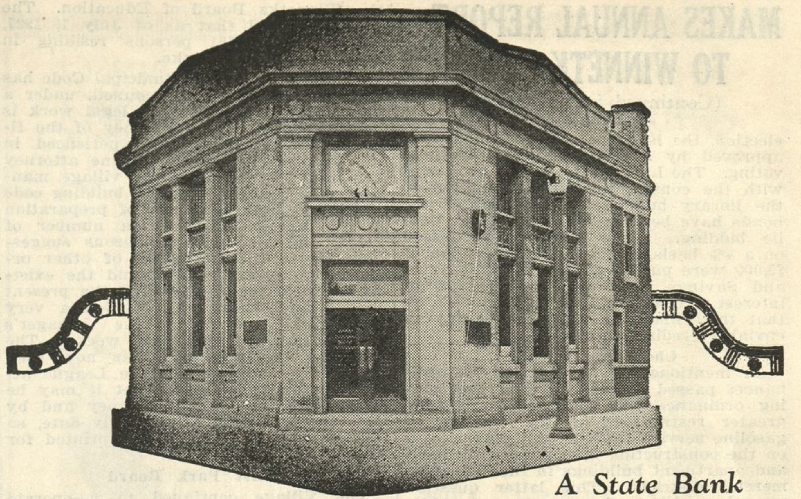
A State Bank