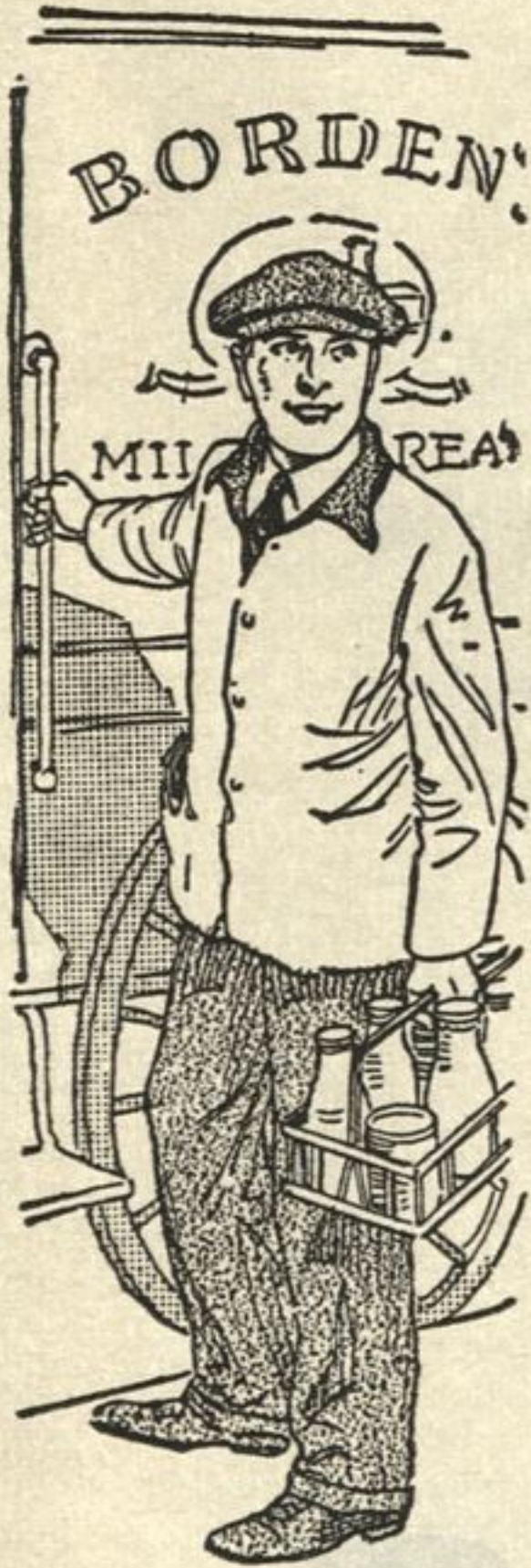
You'll like Borden's Cream, too. Has a mild, pleasing flavor and keeps sweet.