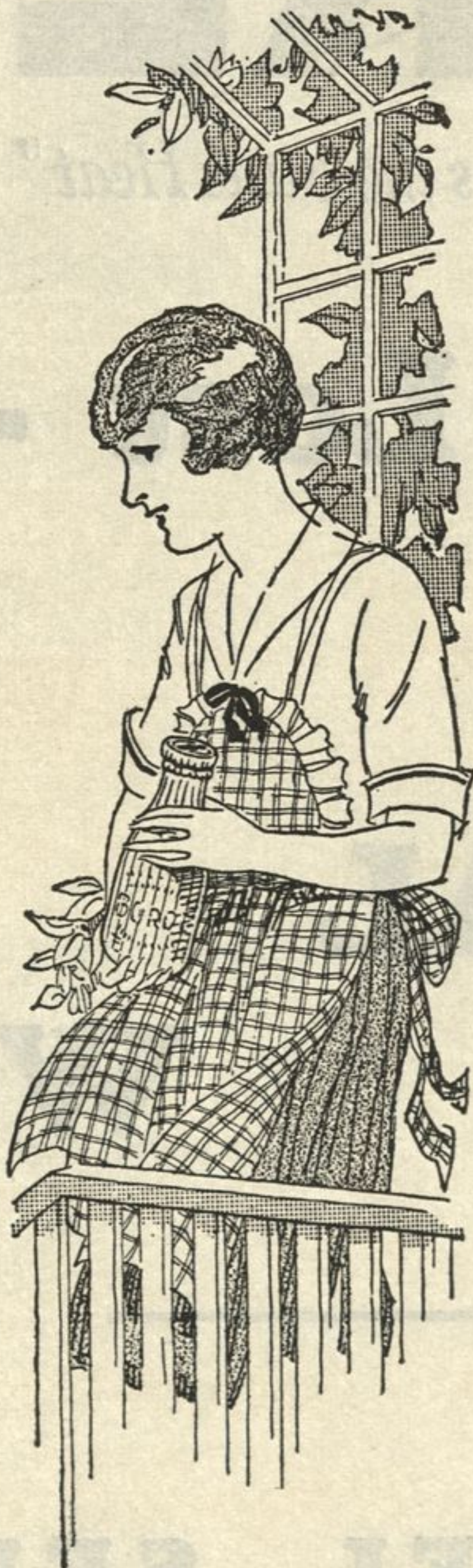
17¢ a Quart

You'll always be glad you changed to "Selected."