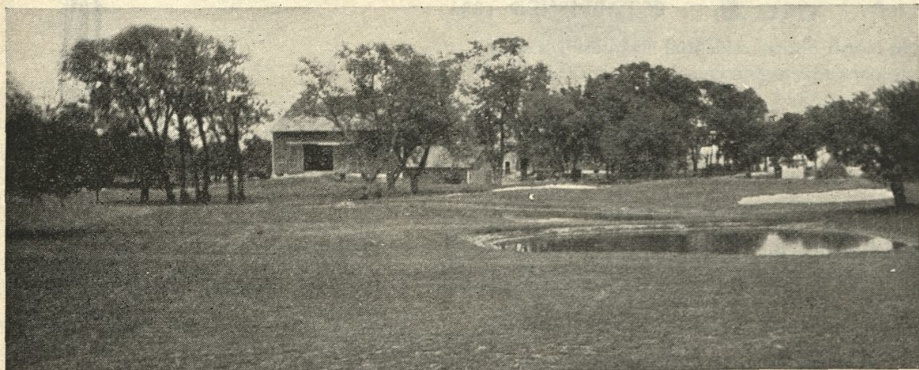
Clumps of trees, rolling stretches of velvet turf, water and sand hazards abound at Pickwick, as may be seen from the above picture. (Advertisement)

Pickwick's week day rate is $1.50, but it is now offering special vacation rates for men, women and juniors. Ten-play tickets are obtainable for men at $10, and for women and juniors at $7.50.