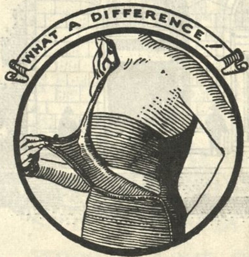
Illustration pictures suit cut open to show Brassiere-In Feature