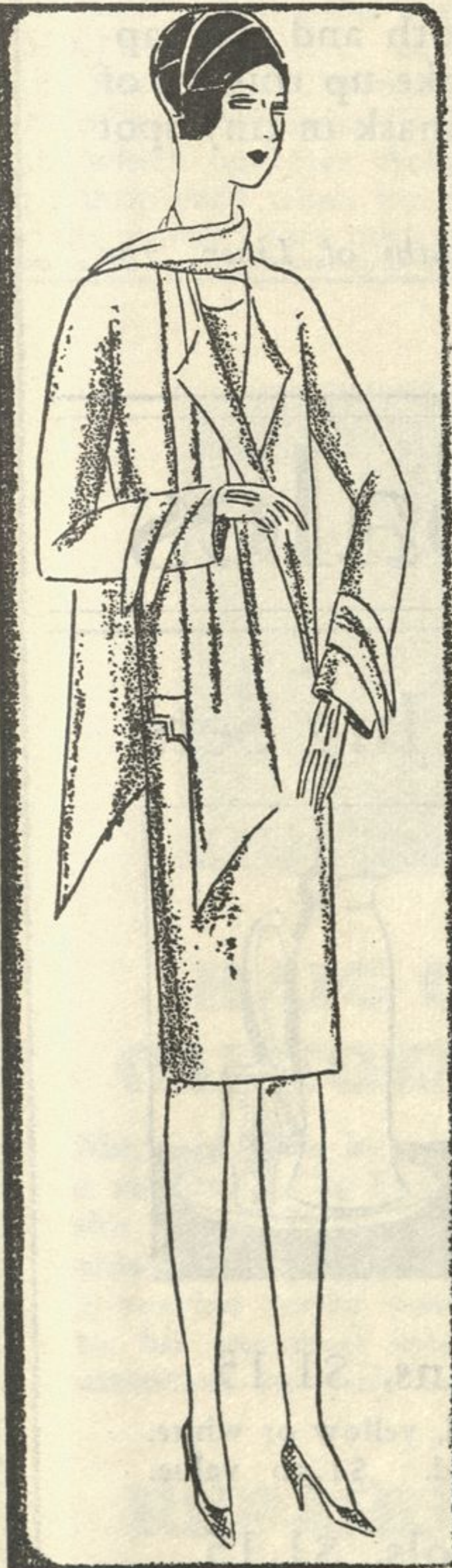
Above, coat of gray kasha with the smart scarf color, $19.75.