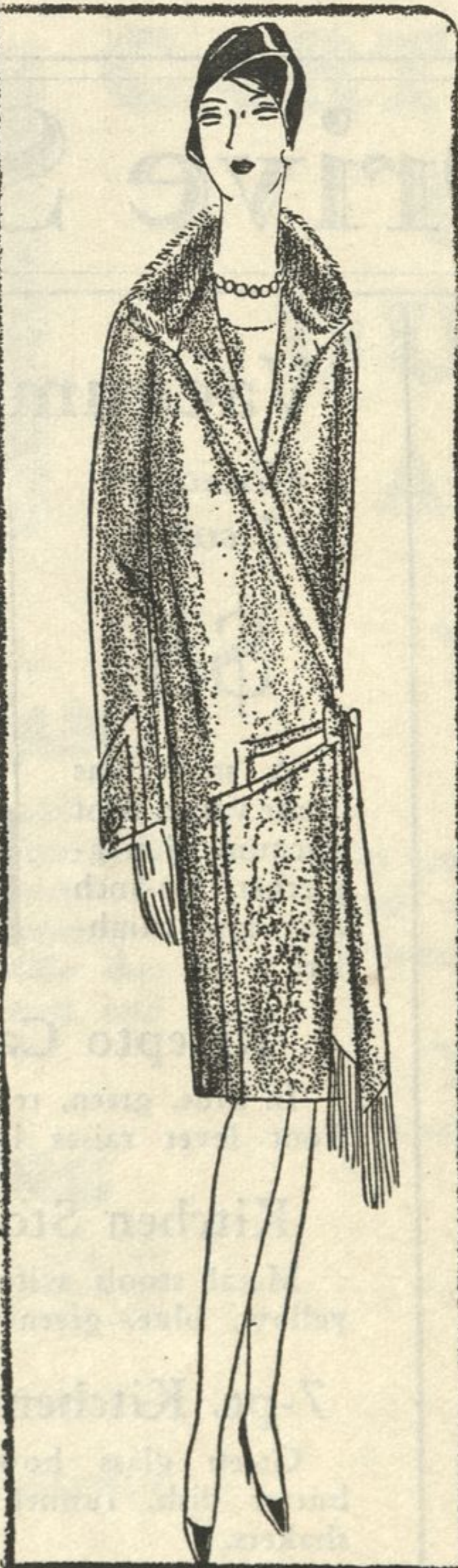
At right, tweed coat, tailored, with belt and patch pockets, $19.75.