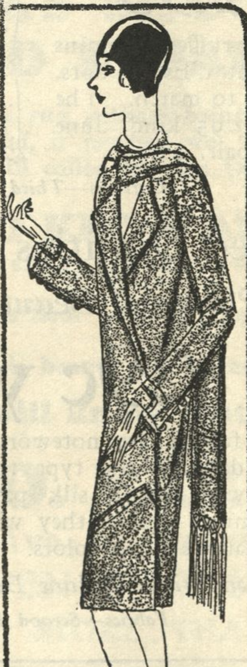
At extreme right, black broadcloth, with fringed scarf collar. In the June Drive, $19.75. Fashions—Second Floor