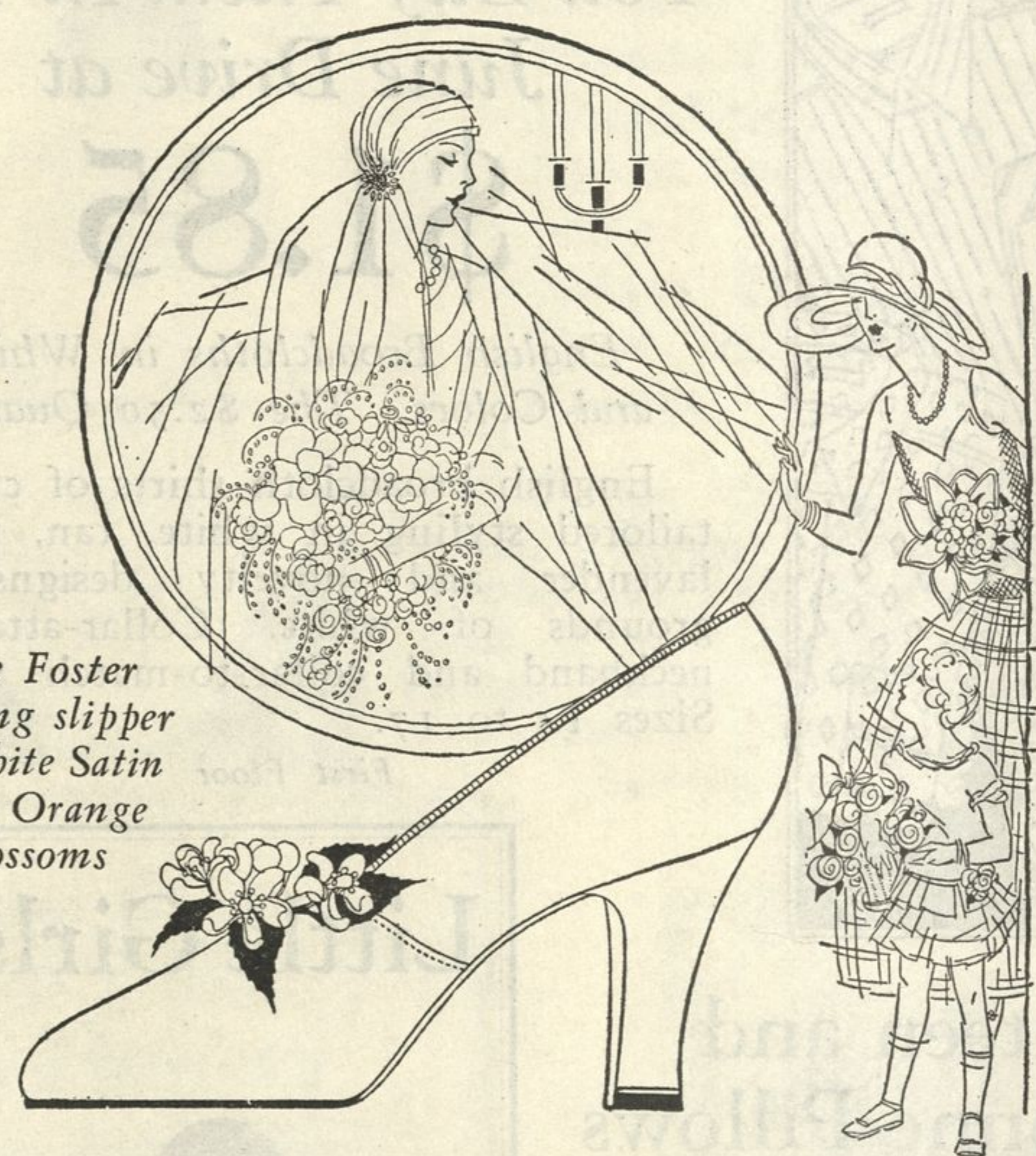
The Foster wedding slipper in White Satin with Orange Blossoms

The Trousseau Shoes and The Bridesmaids' Slippers