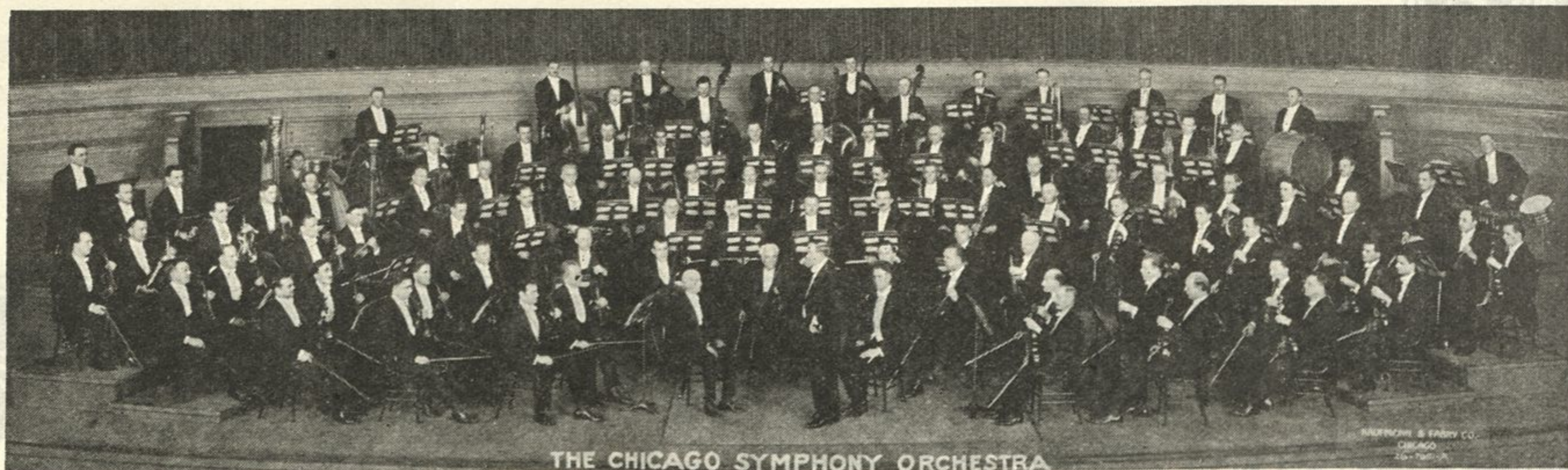
THE CHICAGO SYMPHONY ORCHESTRA

Frederick Stock's famous Chicago Symphony orchestra will as usual contribute an important part to the music festival next week.