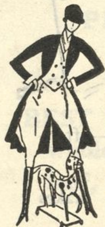
THE HORSE CANTERS INTO THE MODE