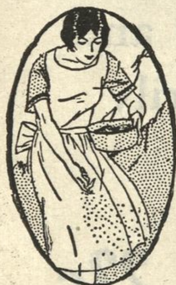
Sown by hand like grass seed

SCIENCE now shows the way to secure what you have always wanted—velvety lawns, crisp, succulent vegetables, beautiful flowers, luxuriant shrubs and trees.