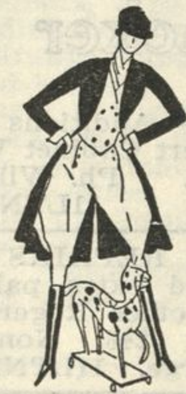
THE HORSE CANZERS INTO THE MODE

Community Nursery School 769 Locust St. Phone Winn. 2560