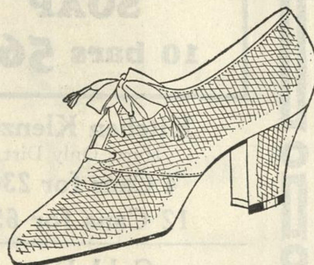
A smart street oxford in Lizard Calf