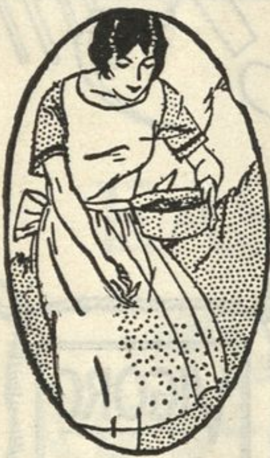
Sown by hand like grass seed

SCIENCE now shows the way to secure what you have always wanted—velvety lawns, crisp, succulent vegetables, beautiful flowers, luxuriant shrubs and trees.