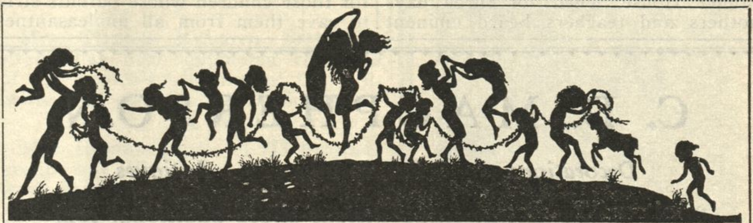
Dancing Nymphs get thirsty, likewise do they eat. Folks who feel this cosmic urge know where to find a treat; and of course it's at the "PANTRY" in Evanston, at 524 Davis St. Soda, Luncheon, Afternoon Tea, Dinner and late evening Refreshment. Open at 11 A. M. Sundays 4 P. M. A delicious full course Dinner at $1.25 served 5:30 to 8 P. M. on week days.

Illinois has the largest and best glass sand deposits in the United States.