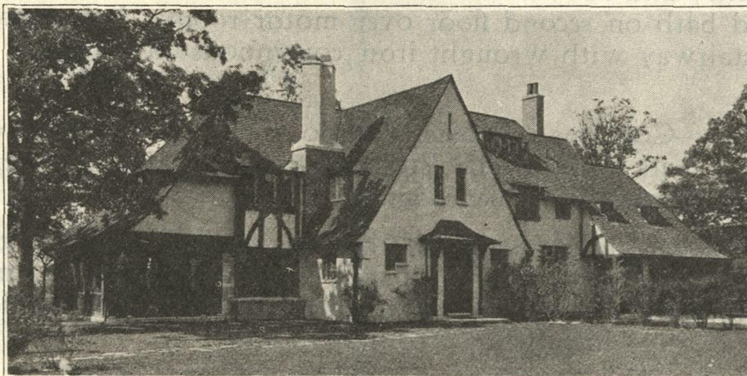
Stucco and Tile—Price $65,000