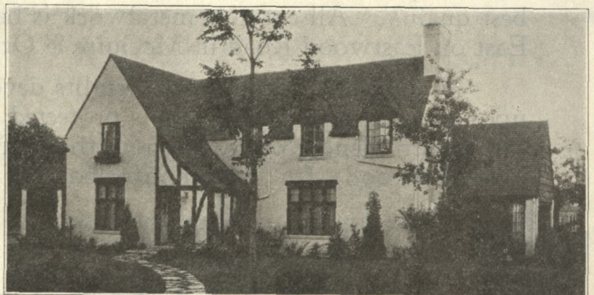
Brick, Price $46,000

These Homes Can Be Duplicated on Your Own Lot at Reasonable Prices.