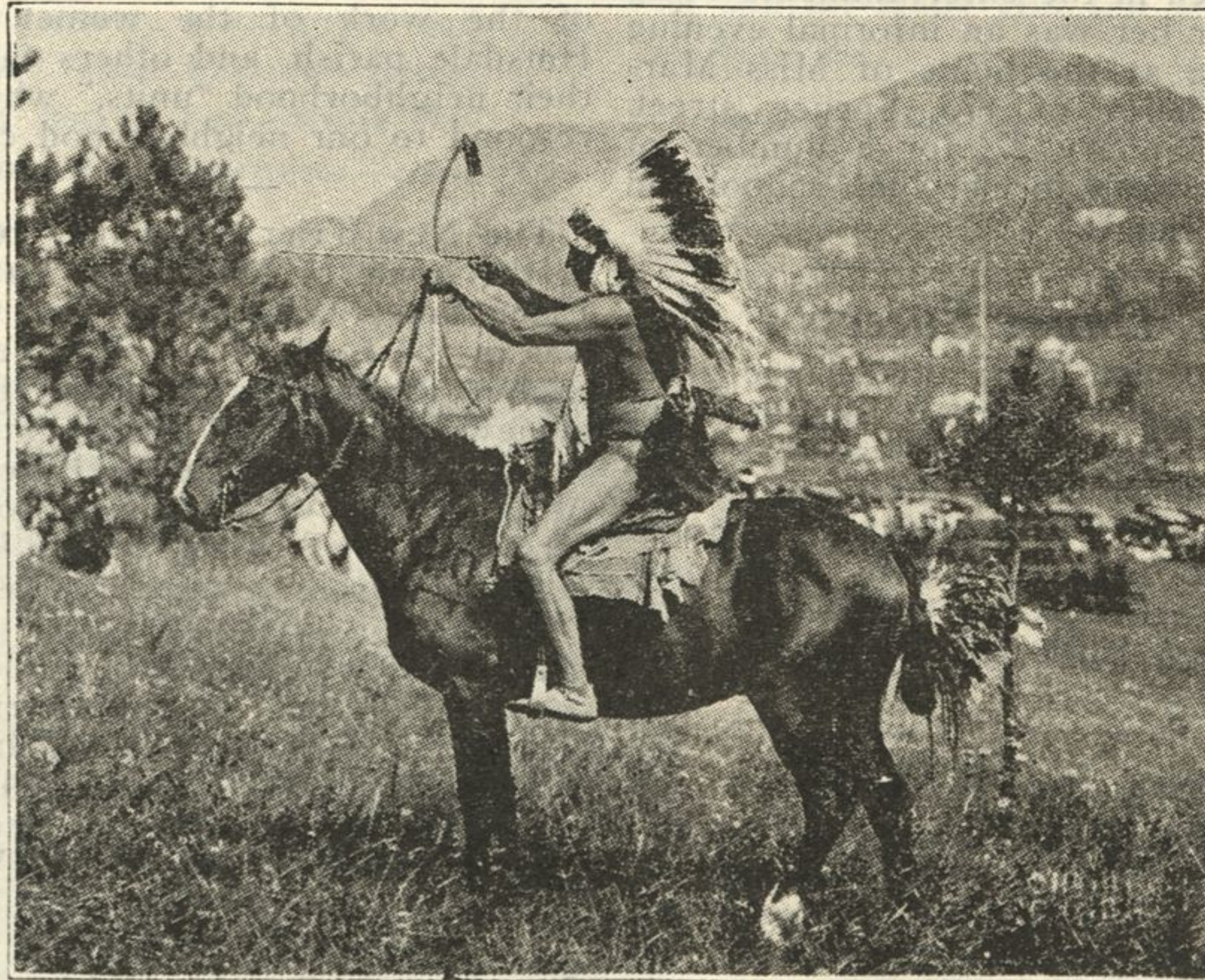
Pictures will be accompanied by a word picture of The Black Hills by Mr. Warner Putnam.

For Informa- tion, apply to Black Hills Expedition.