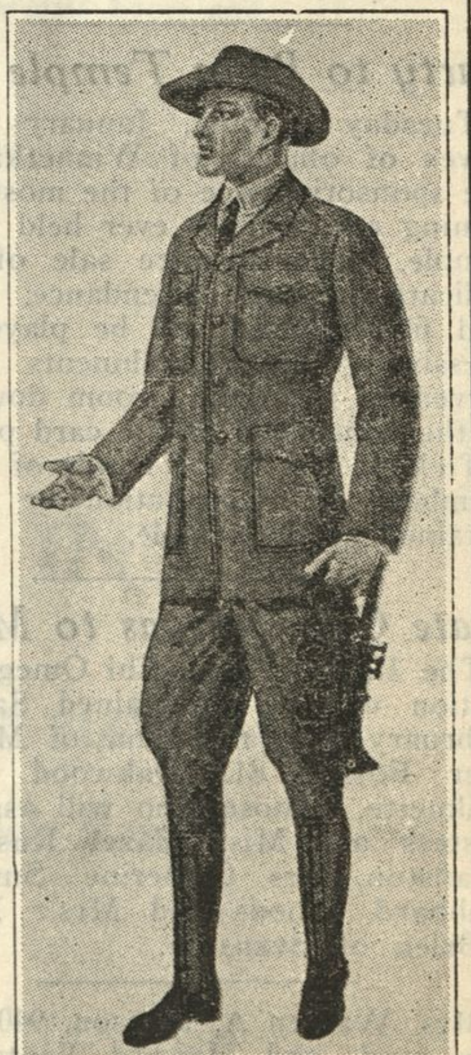
Black Hills Expedition Uniform.

1505 B e l l Bldg., 307 N. Michigan Avenue, Chicago Phone Dearborn 2918