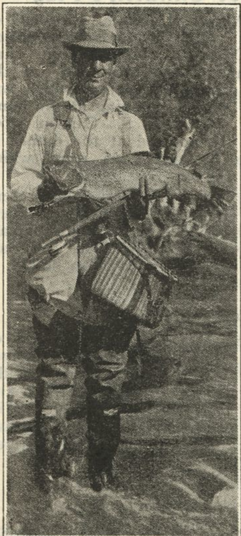
Locklaven Trout— Rapid Creek—9½ lbs.

For Informa- tion, apply to Black Hills Expedition.