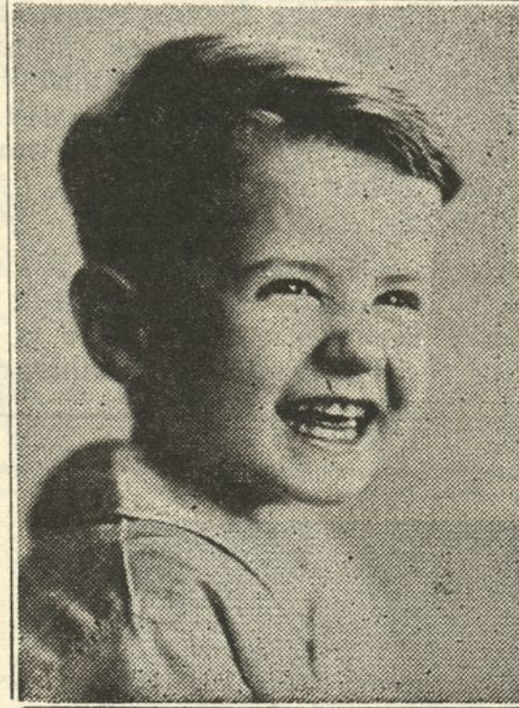
All Children Smile for Bernie