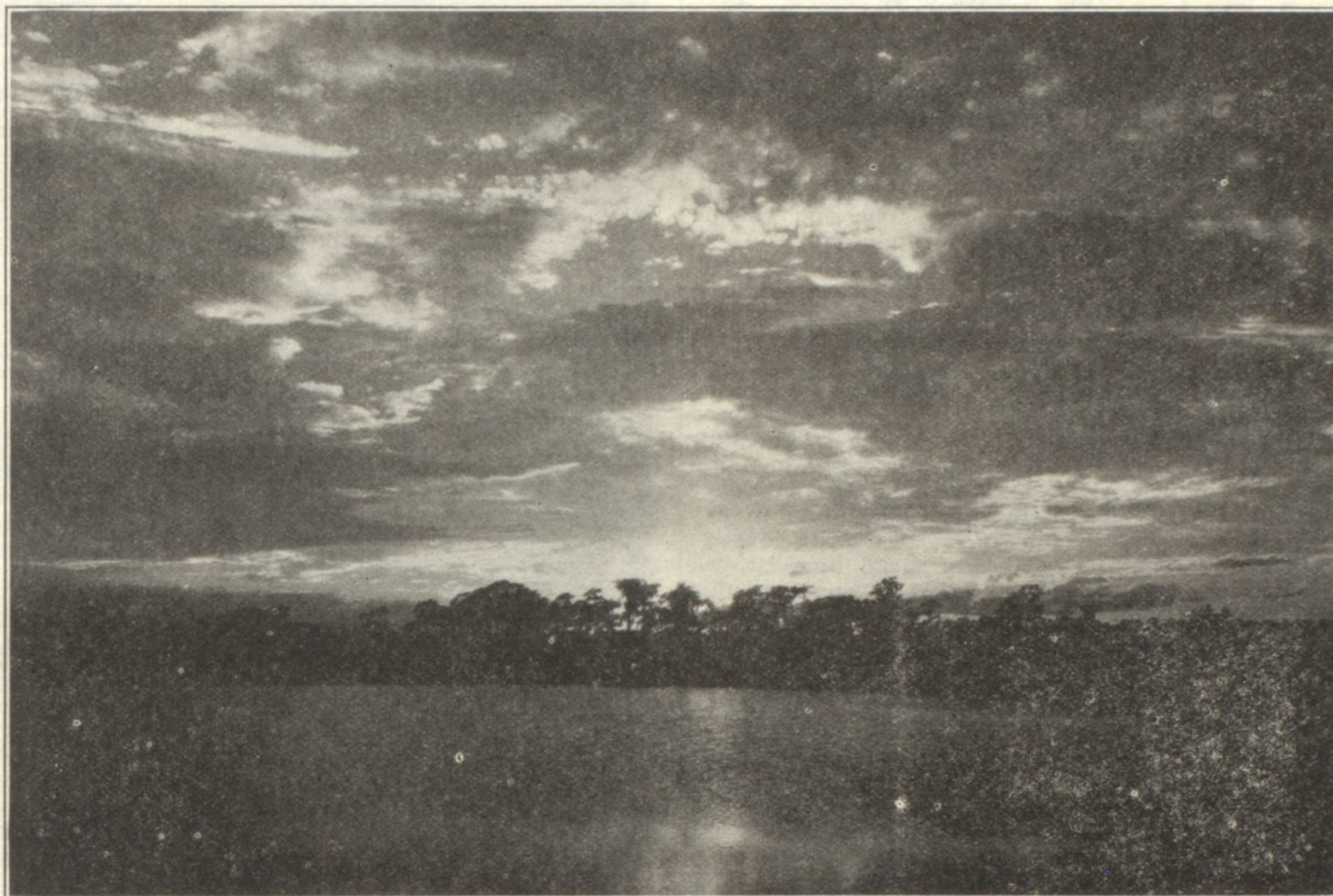
"SUNSET ON LAKE DAVENPORT AS SEEN FROM THE SEVENTH GREEN OF THE HOLLY HILL 18 HOLE GOLF COURSE, DAVENPORT, FLORIDA"

Banish Business Cares— Come Play and Rest in Florida