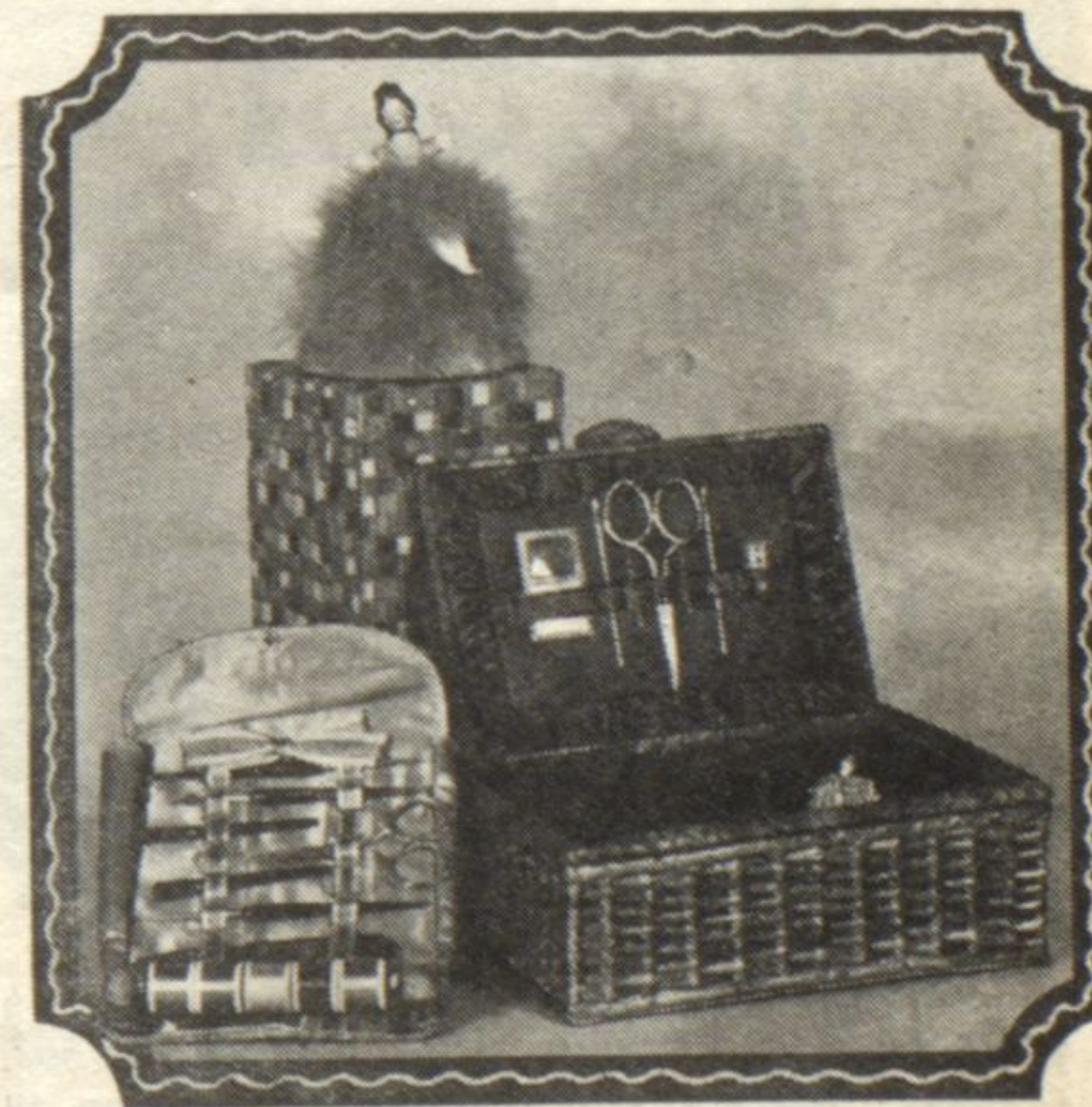
For she who sews there is this fine sewing basket with imitation reptile leather cover, $6.95—and a sewing kit at $4.95, and an unusual pin cushion from Germany, $1.95.