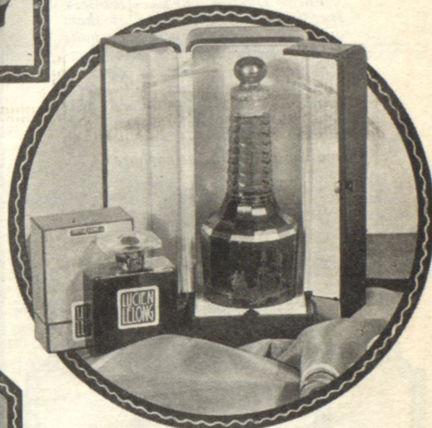
Houbigant's Quelques Fleurs or Ideal perfume is encased in a beautiful leather box—about 8 ounces, $25. Lelong's perfume in three odors: $22.50 for the large size bottle.