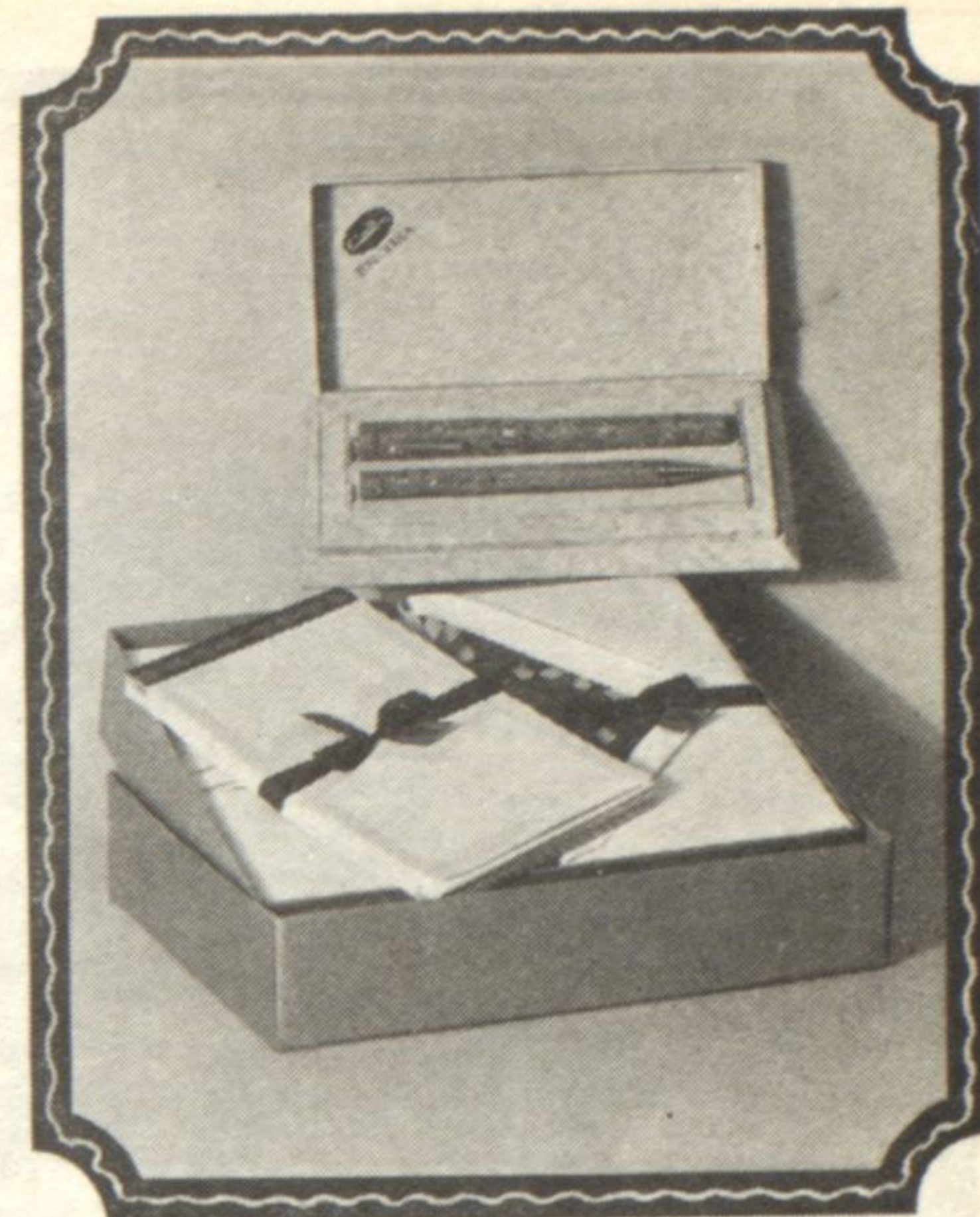
A distinctive box of stationery with lined envelopes and sheets with brown and gold border, $2.00. A pen-pencil set by Conklin will bring lasting gratitude, $12.00.