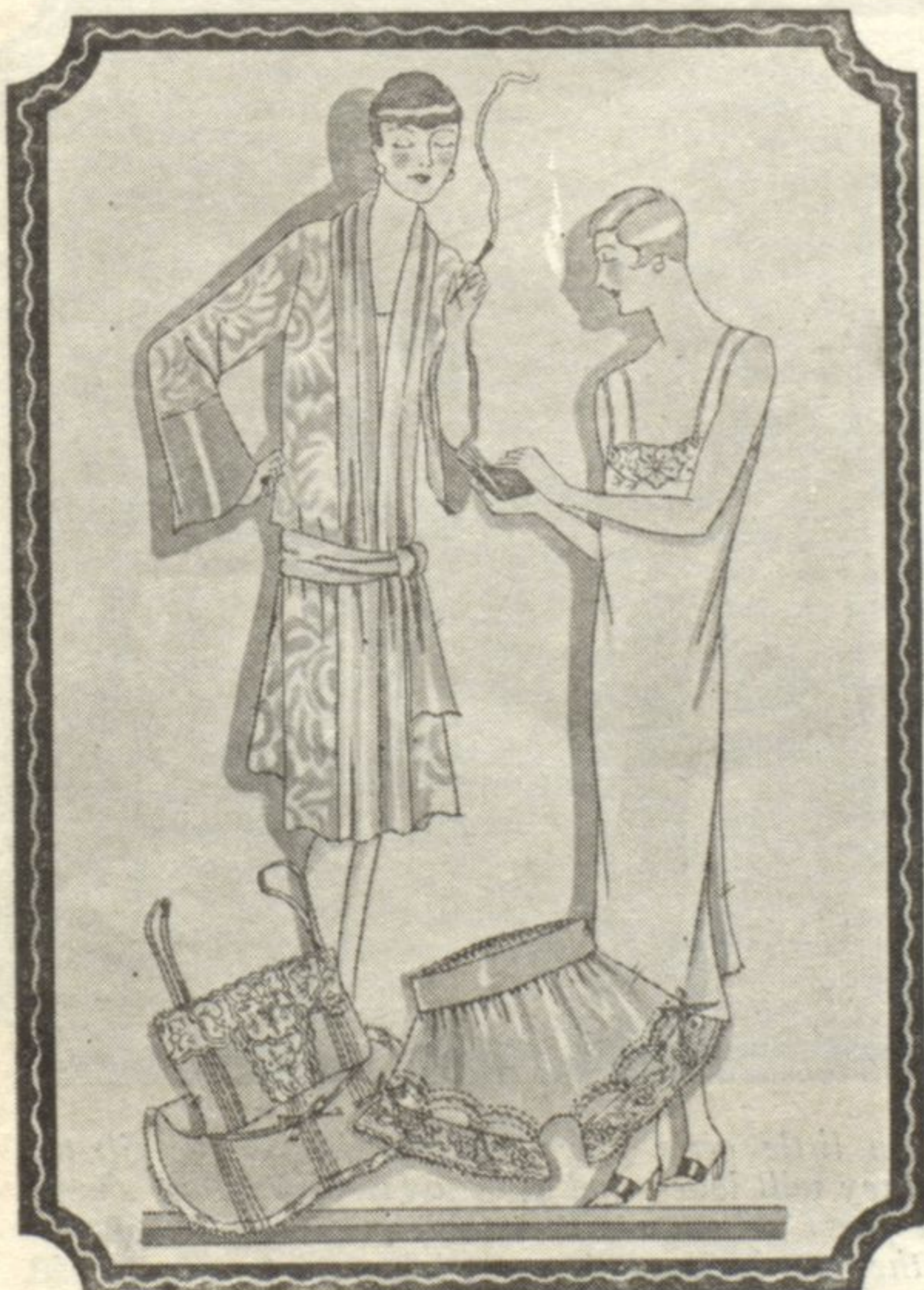
New is this brocaded silk robe at $16.95, and gifty is this gown at $7.95. Crepe de Chine chemise at $5.95 and lacy silk step-ins at $4.95.