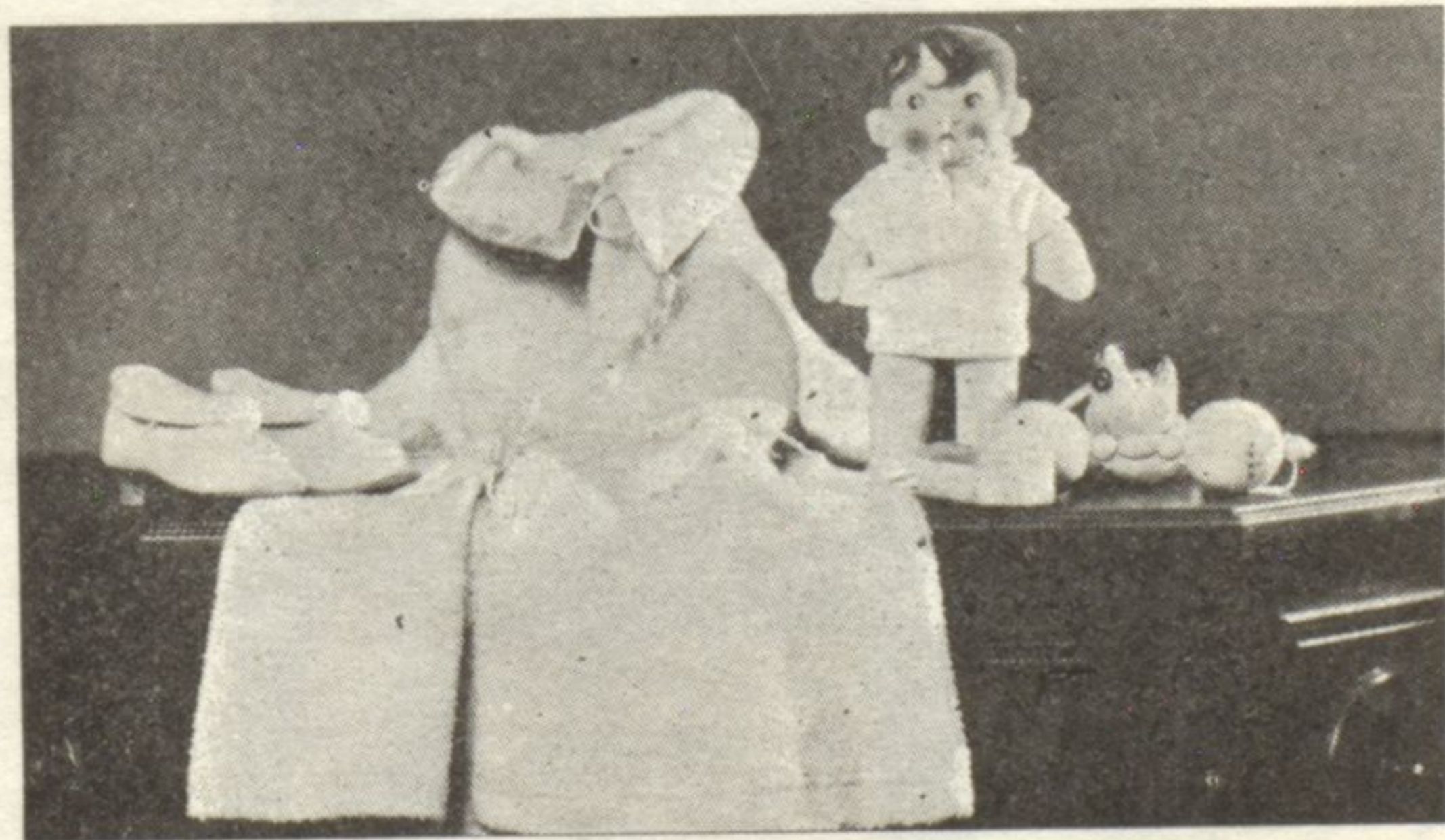
For Baby's Christmas: A downy robe, $4.95; Buddy-doll, $1.95; a rattle at 65c and one at 59c; a rooster at 65c and a pair of felt slippers at $1.00.