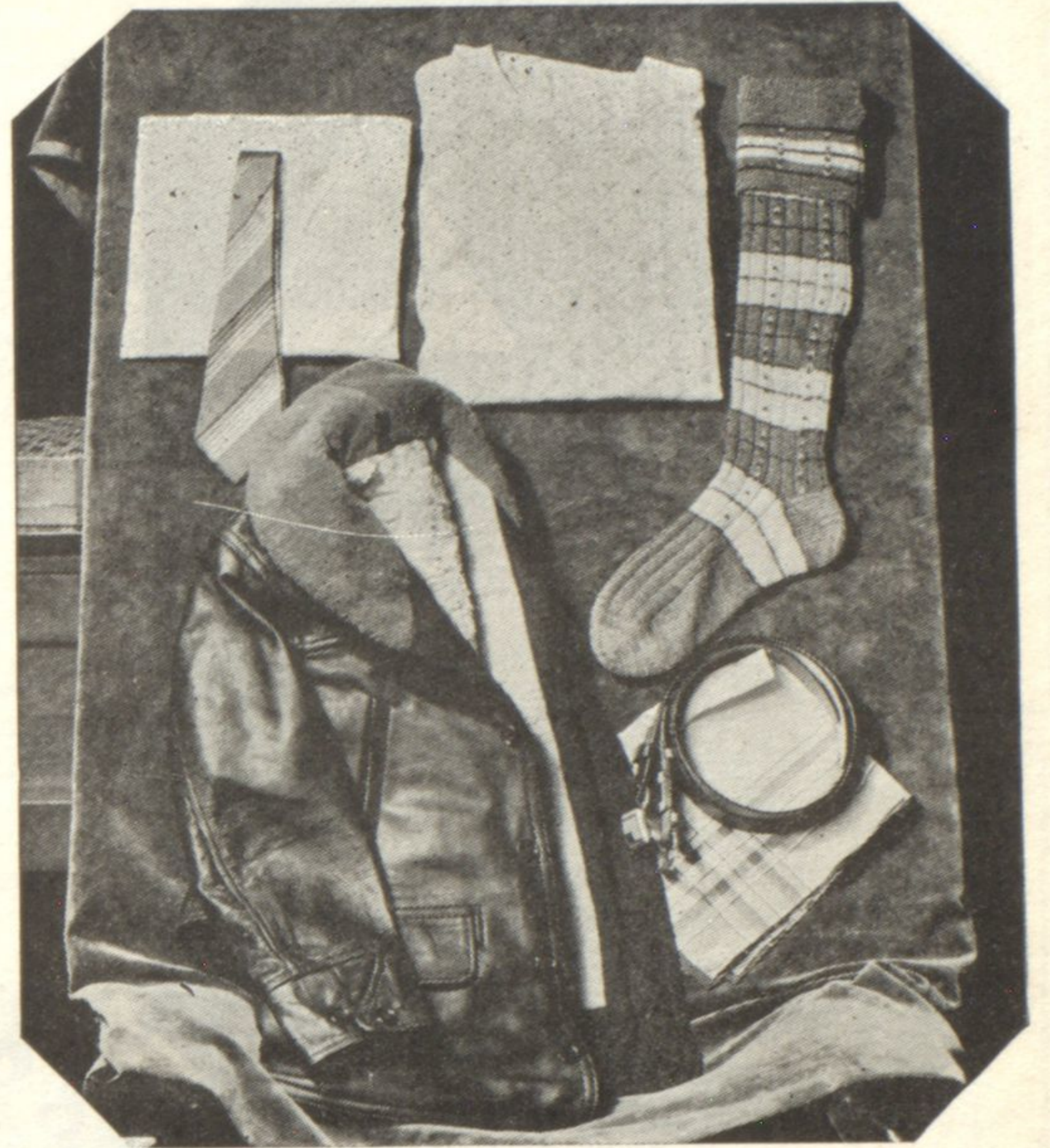
Boys' sheep-lined black horsehide coat with 4 pockets, $19.50; "Collegiate" broadcloth shirt, $1.50; striped tie, 65; Hickok monogram buckle and belt, $1.00; novelty pajamas, $1.85; fancy wool golf hose, $1.95. The new boys' section is laden with gifts that will bring Christmas joy to every North Shore youth.