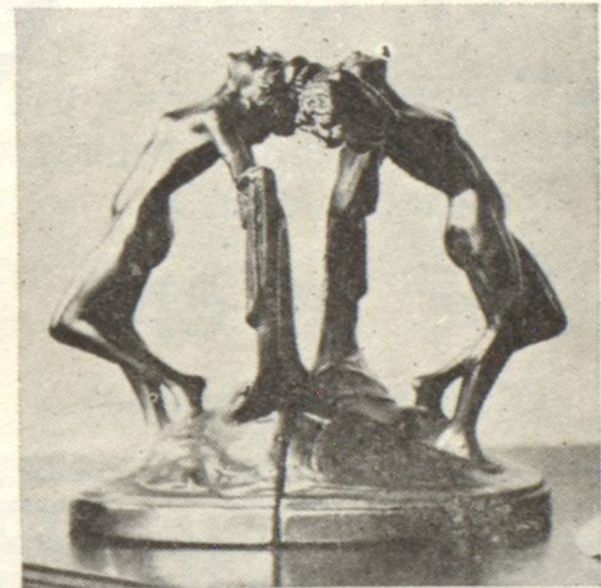
"Dance of the Seven Veils" as caught in a pair of bronze book ends at $15.95.