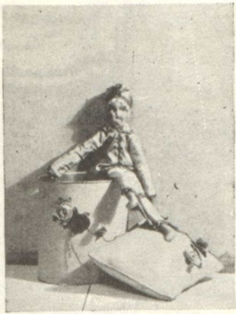
A felt pillow, $3.50, matches a felt covered waste paper basket, $3.95, embellished with felt roses in pastels. The French Doll, $3.95.