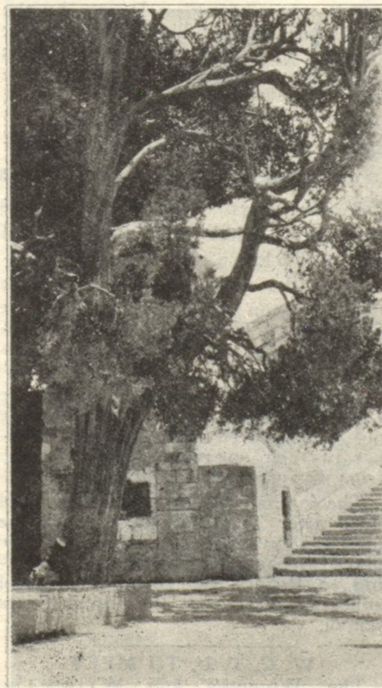
Steps to the Holy of Holies in Temple area.

sights of Old Jerusalem. I had rather not and I had better not. Rather, because there is so much of disappointment about them. They are so entrusted with slender probability. And better because Religion is my business and I know I would grow technical and I am sure I would hurt the sectarian sensibilities of some good reader. Come and talk with me and I will tell