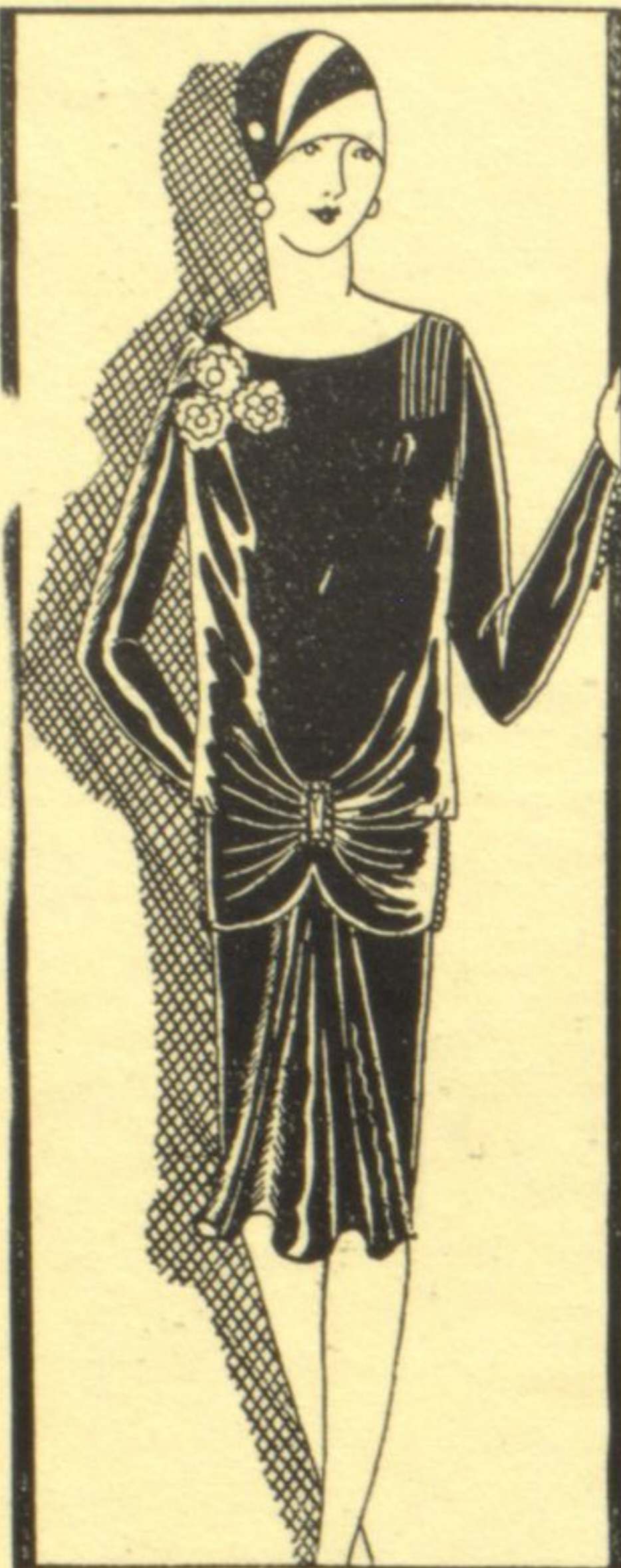
Designed of velvet, georgette, crepe satin, jersey, wool georgette and velvet combinations.