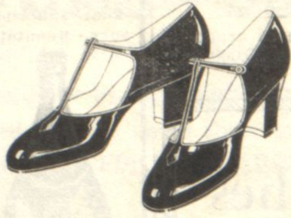
The T-Strap Nine Dollars