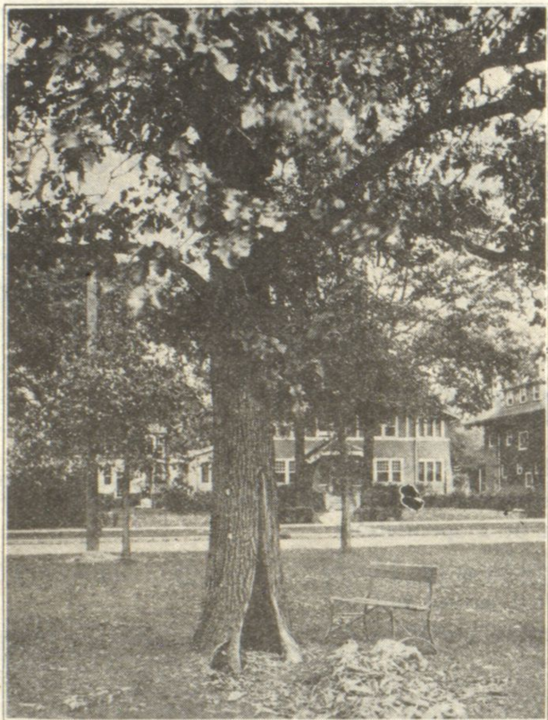
The first steps in saving a splendid tree. Decaying matter removed; trunk ready for cavity work and bolting.

556 CENTER ST. —WINNETKA— PH. WINN. 1949