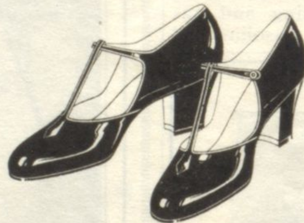
The T-Strap Nine Dollars