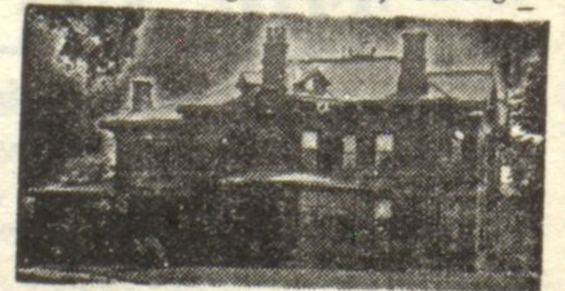
Students' Residence—in the heart of Chicago's finest residential district

School of Domestic Arts & Sciences 6 N. Michigan Blvd., Chicago