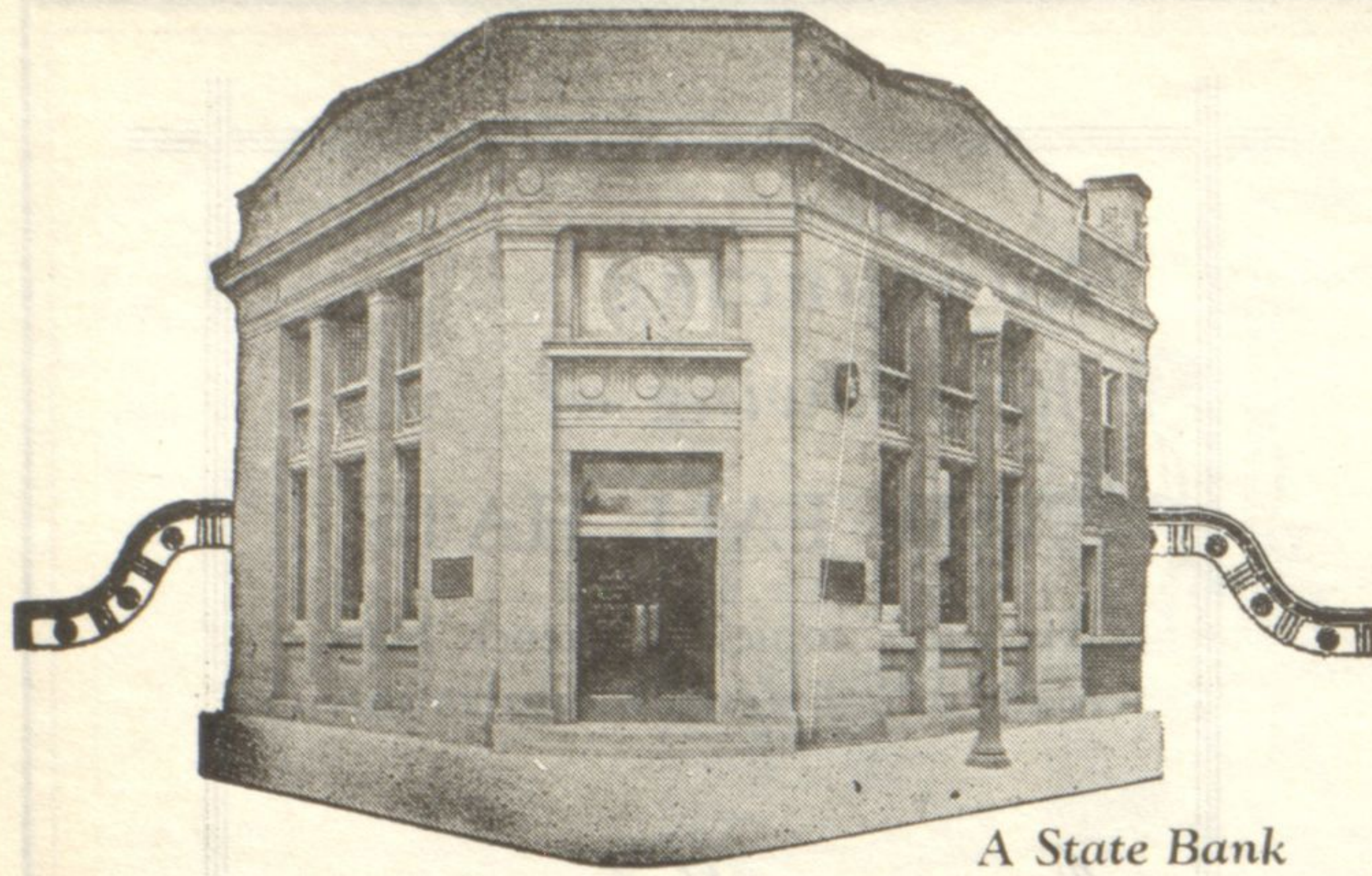
A State Bank