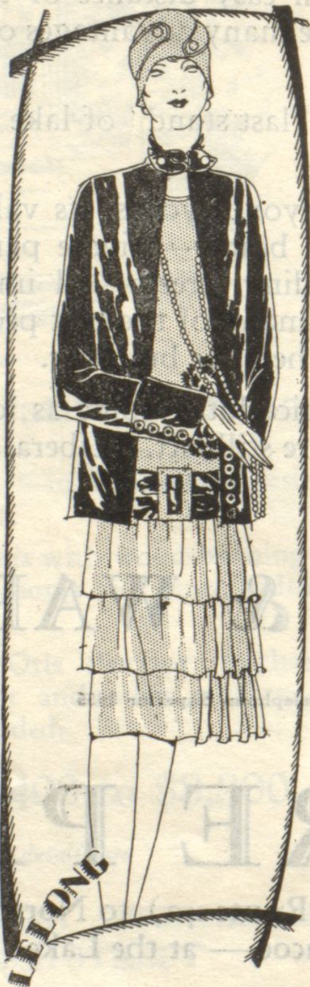
Lelong created the original of this frock, pictured right. The jacket is of transparent velvet; the skirt features tiers, so smart for fall, $50.