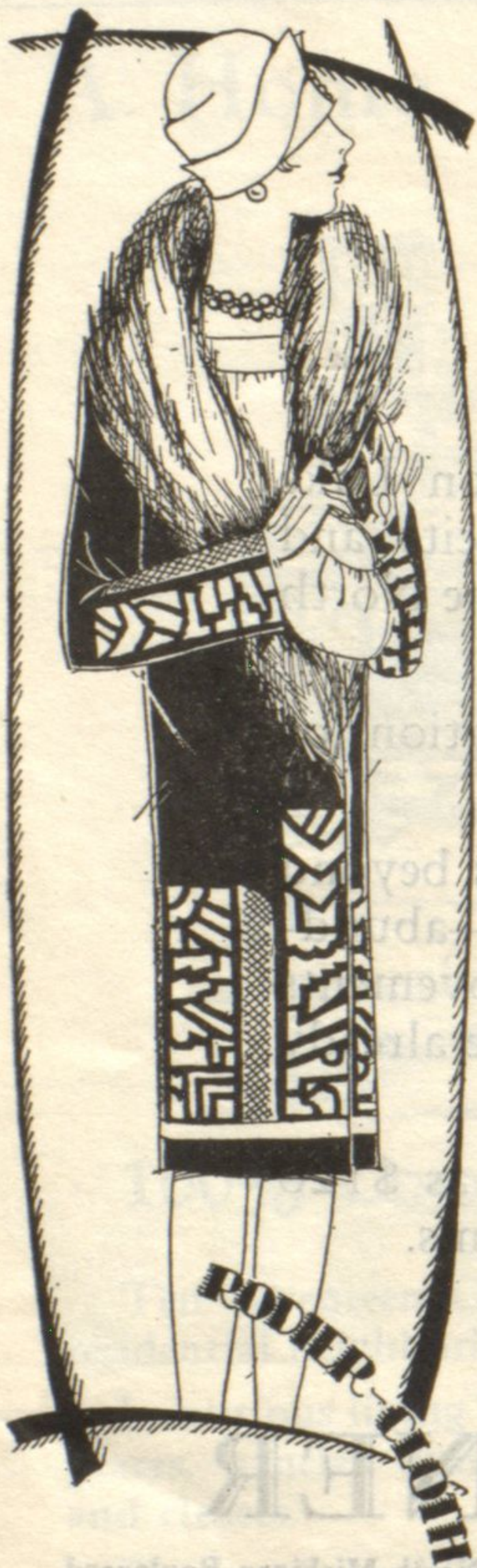
At the left, a coat of black Rodier cloth with border in deep red, finely stenciled in black. The collar is red fox, $125.

By stenciling and tiers, Fall fashions mount to new smartness. The two models below show how Rosenberg's collections bring forth the new mode as North Shore women will wear it. Among the models offering ultra-smartness are replicas of the signal successes of Paris couturiers.