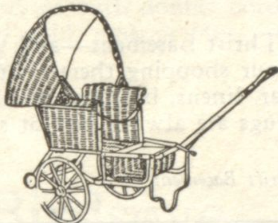
LLOYD STROLLER Full sized - corduroy upholstered. Rugged - comfortable - good looking. Now only $50.00