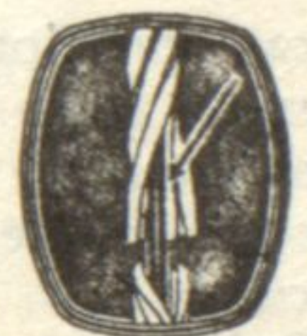
The steel wire center in every upright strand gives unusual strength. Exclusive with Lloyd Carriages.

COME in today and see our attractive showing of Lloyd Baby Carriages, Strollers, and Sulkies. No carriages made are smarter, more comfortable, more stylish, or lighter and easier to handle than are Lloyds with their beautifully finished bowl shaped bodies - woven on the famous Lloyd Loom. These are the only baby carriages whose fabric has a steel wire center in every upright strand. None others have such enduring strength, such beauty and permanence of weave.