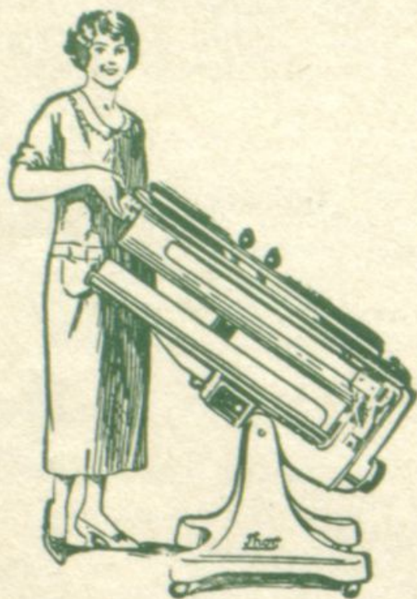
Gas Heated Ironer

Have a Laundry Corner in your kitchen, not just some tubs, an old time rub board and flat iron, but a modern up-to-date laundry equipment so you can do it better with gas on every wash day. You want a gas heated washer for instance, a gas clothes dryer, and a handy gas heated ironer that folds up and rolls away into a corner when not in use.