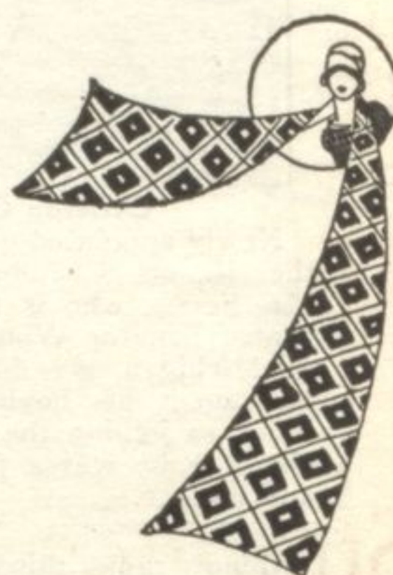
Lord's—Neckwear and Trimmings—First Floor.

White and flesh georgette bias banding, $1.50 yard.