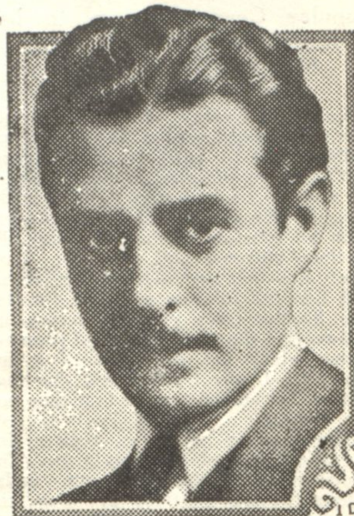
JOHN GILBERT IN "MONTE CRISTO" WILLIAM FOX ATTRACTION