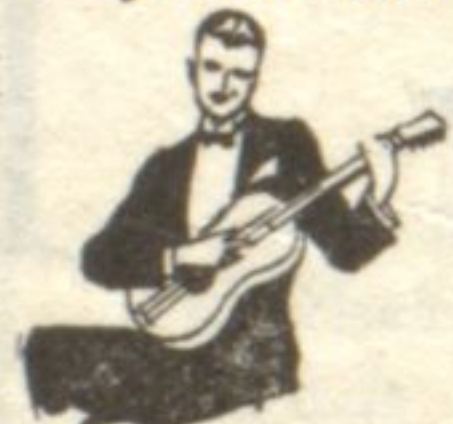
NICK LUCAS "The Crooning Troubadour,"

"What Do I Care What Somebody Said"—fox trot with vocal chorus ... "Nervous Puppies"—fox trot. Mound City Blue Blowers. 3584—75c