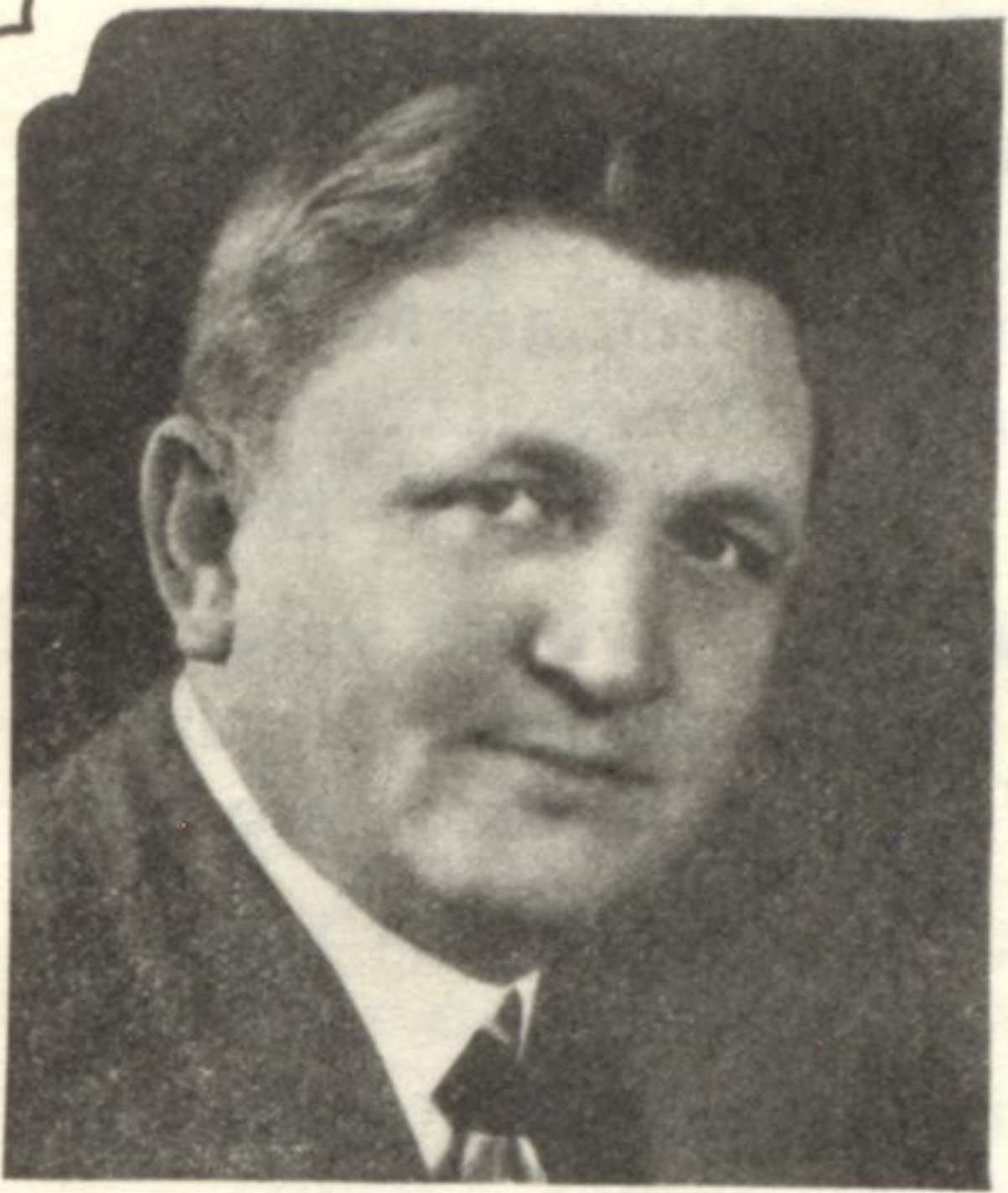
Arthur Andersen ARTHUR ANDERSEN AND COMPANY