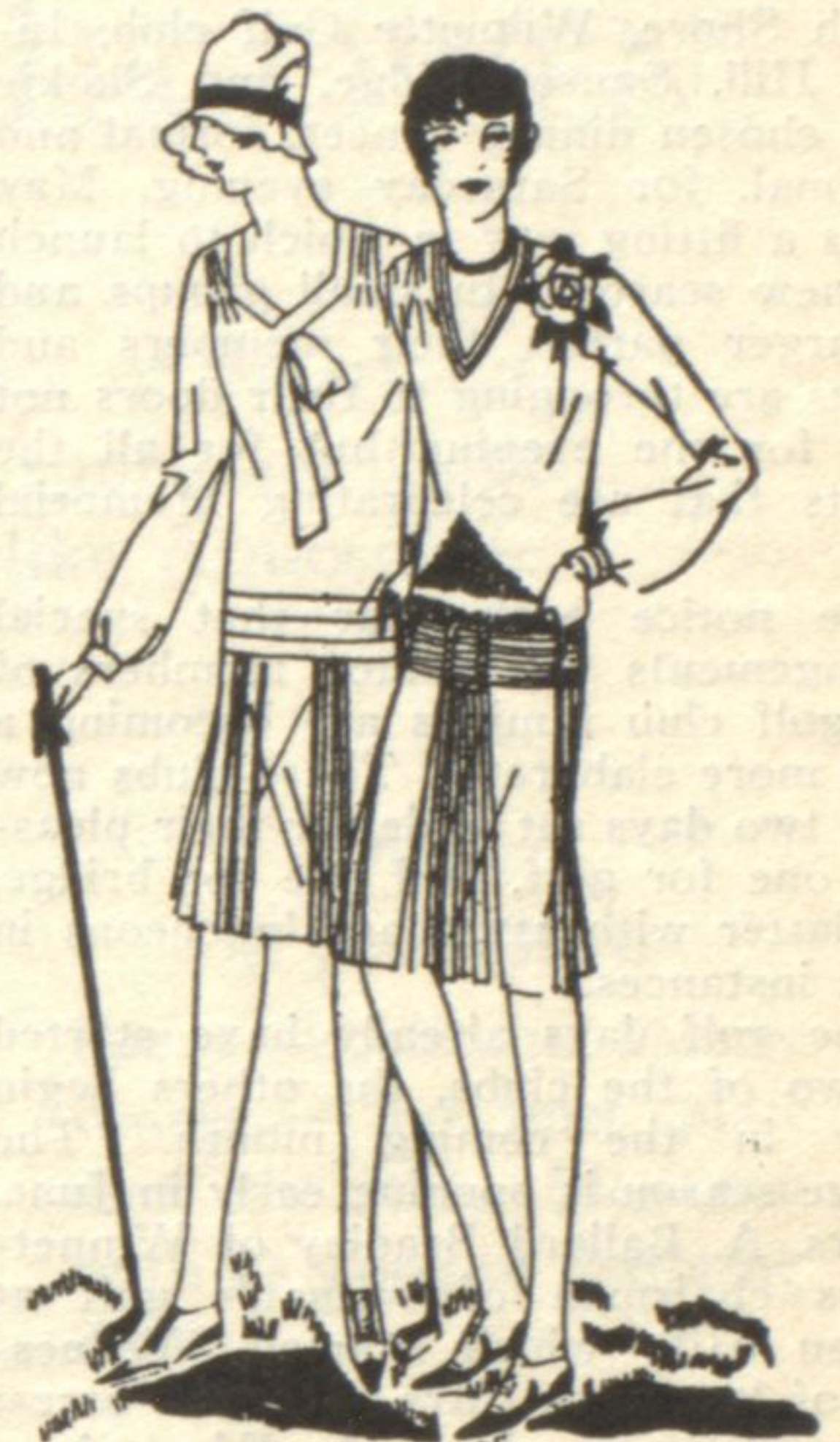
Silk Sports Frocks

Jantzen Swimming Suits for Men, Women and Children—at Rosenberg's