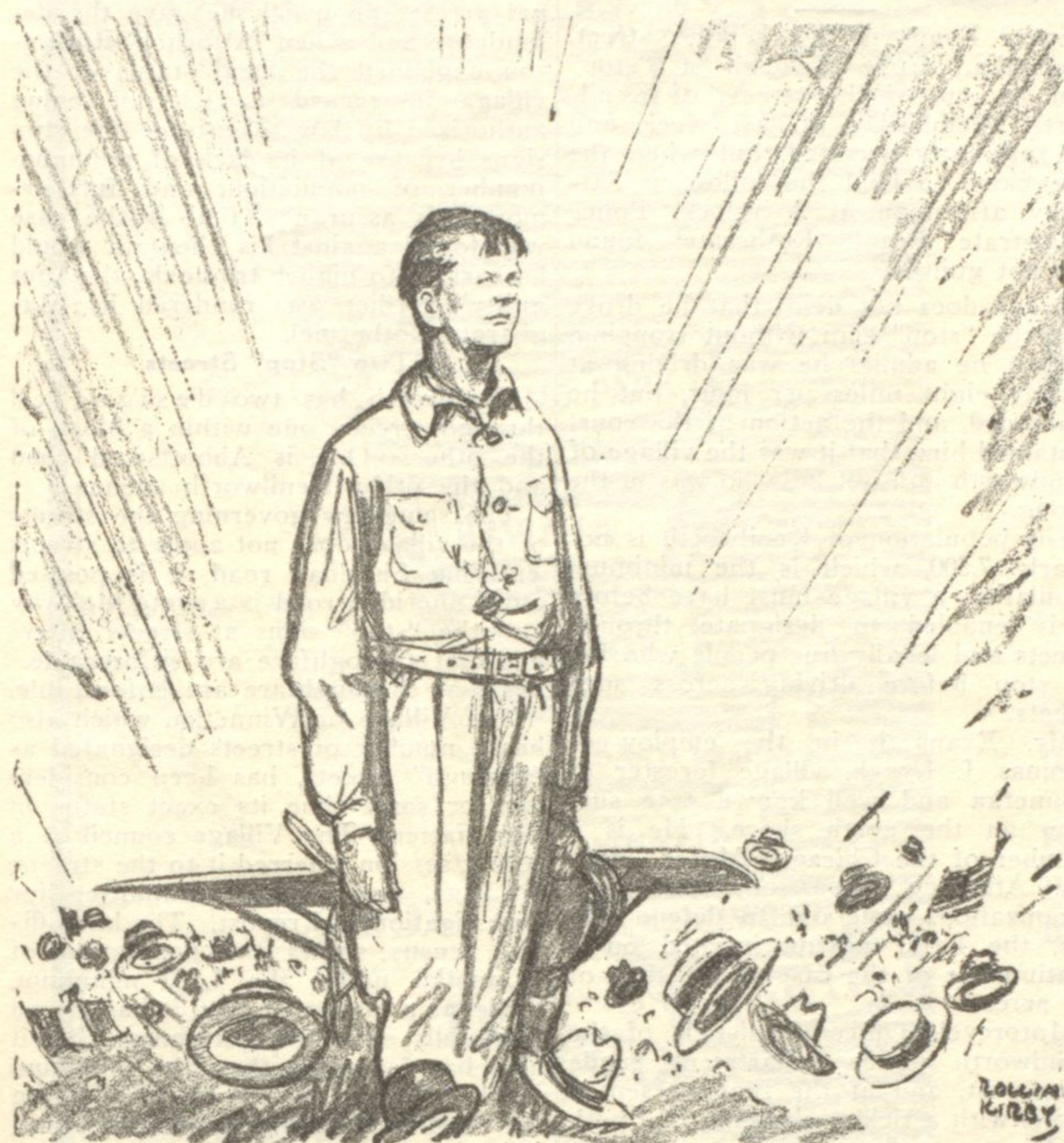
(New York World)