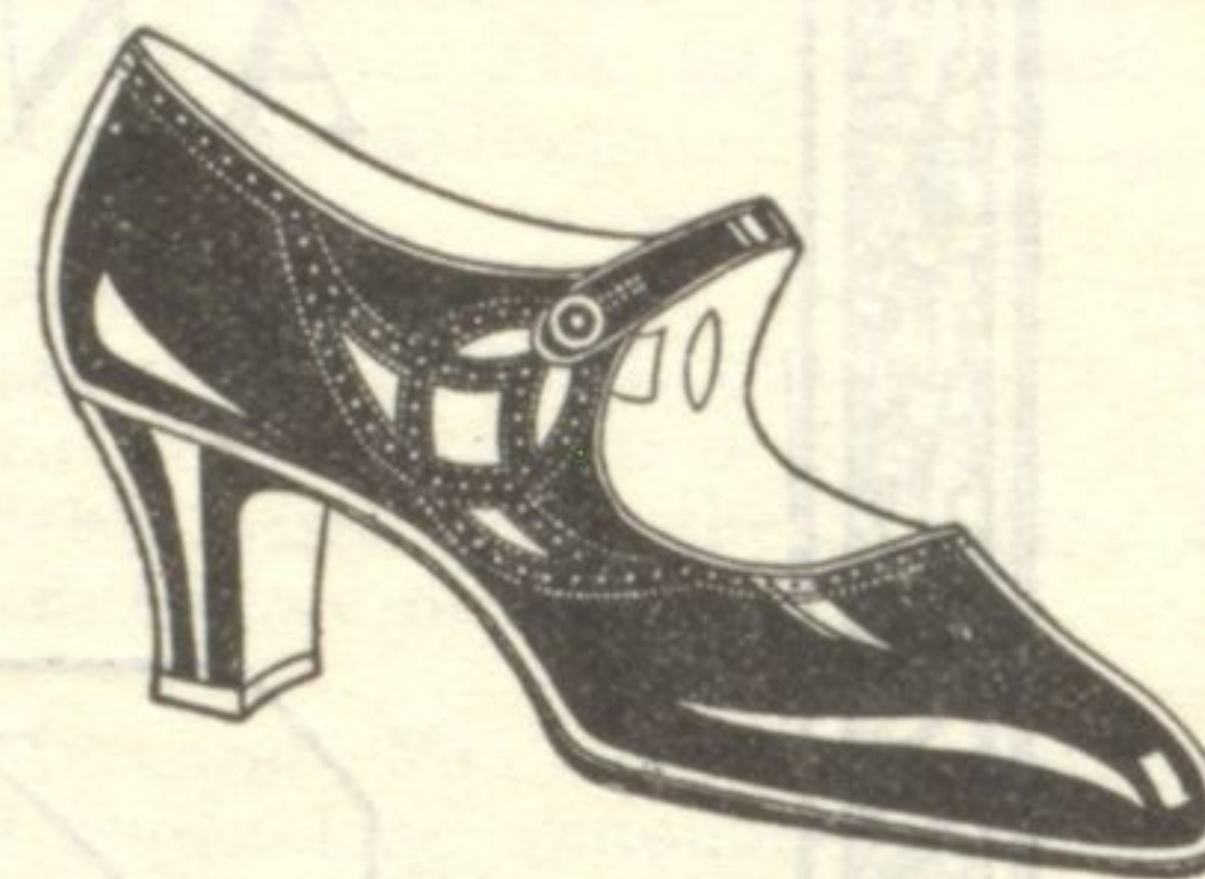
One-strap Red Cross shoe in black patent, black kid, or black satin.

Red Cross Shoes—made over the famous "Limit" lasts and having the Arch-Tone arch-support are as ultra-comfortable as they are ultra-smart.