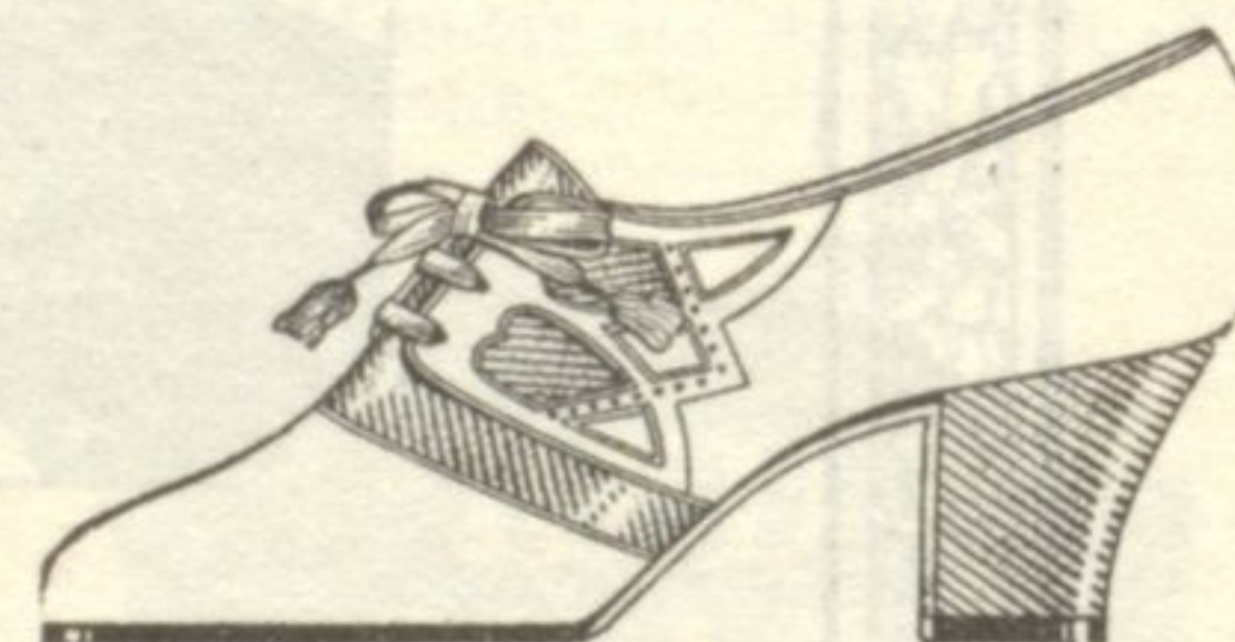
A smart three eyelet tie oxford in tan calf, also comes in black calf.