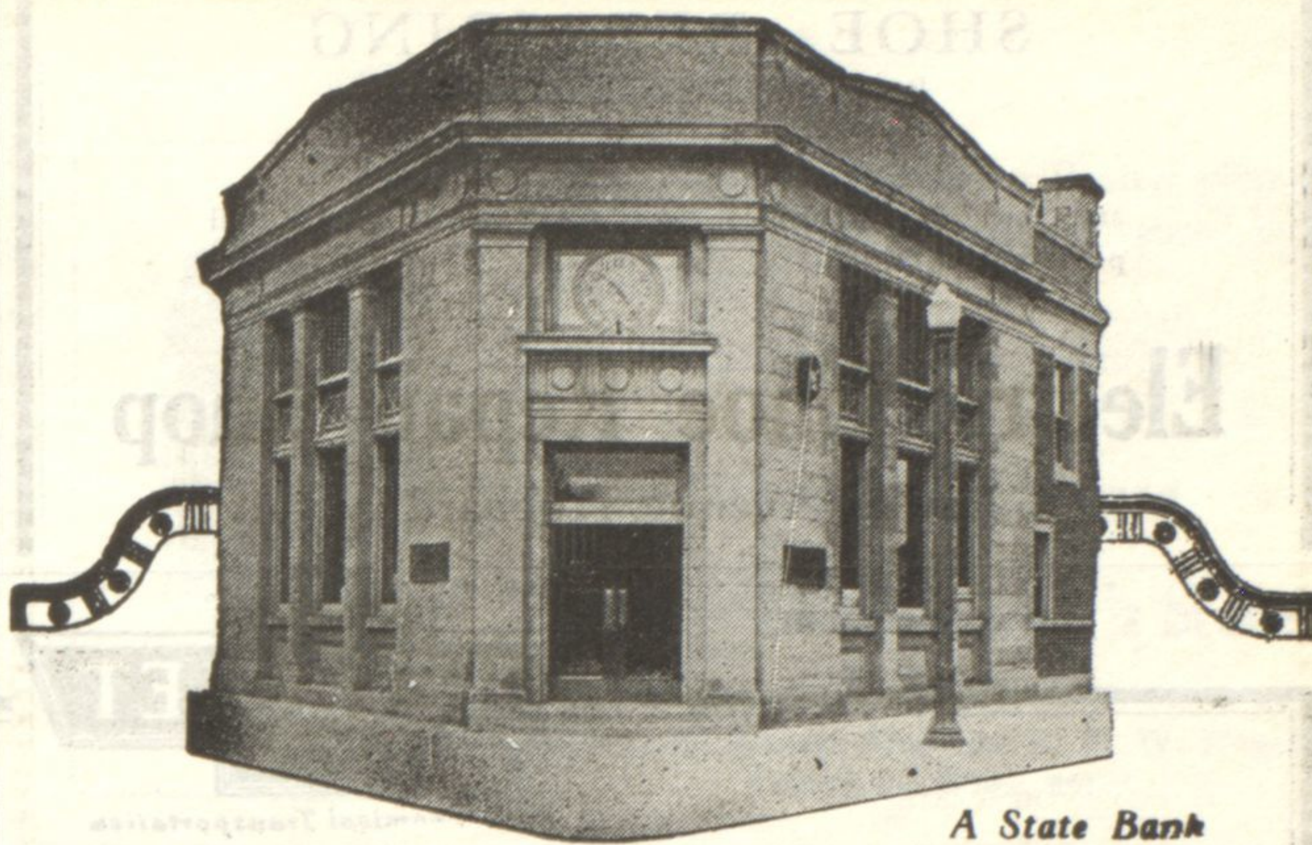
A State Bank

Tuberculosis mortality in Illinois has decreased from 79.3 per 100,000 population in 1925 to 76.3 in 1926.