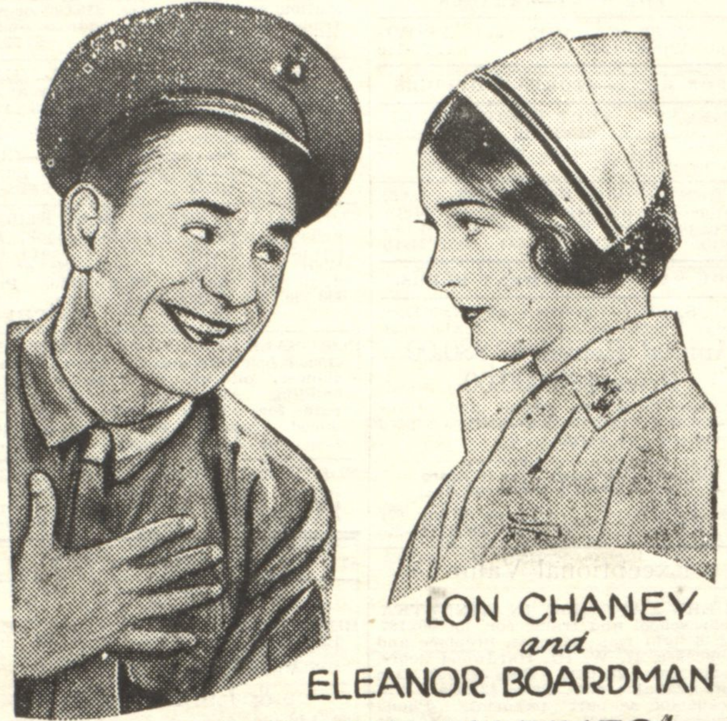
LON CHANEY and ELEANOR BOARDMAN