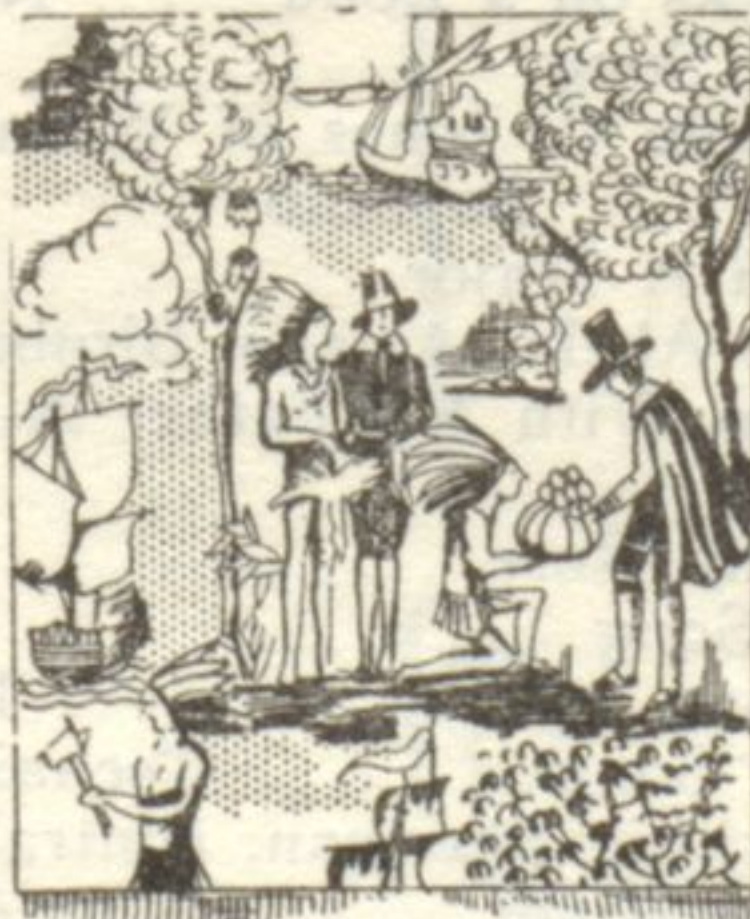
"Penn's Purchase" by Victor White

A novel development in the new chintz is the use of flat pastel colors on tinted backgrounds where bright colorings were formerly used. This is admirably shown in our Du Barry Chintz.