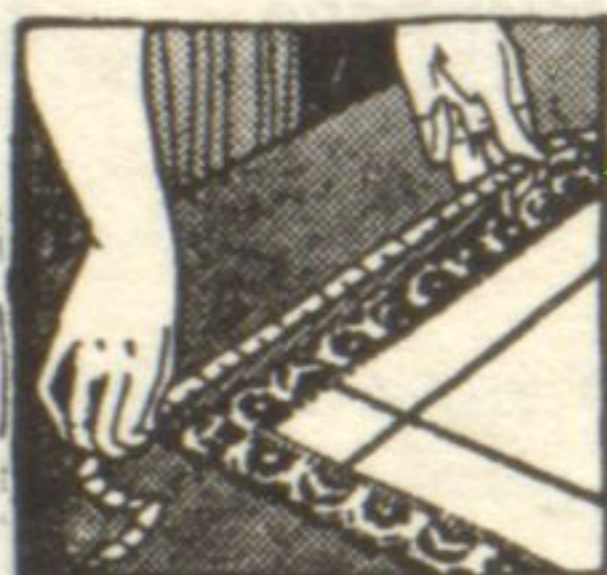
Every curtain is dried to exactly its original size.