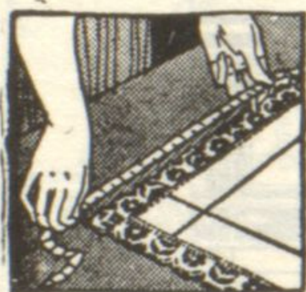
Every curtain is dried to exactly its original size.