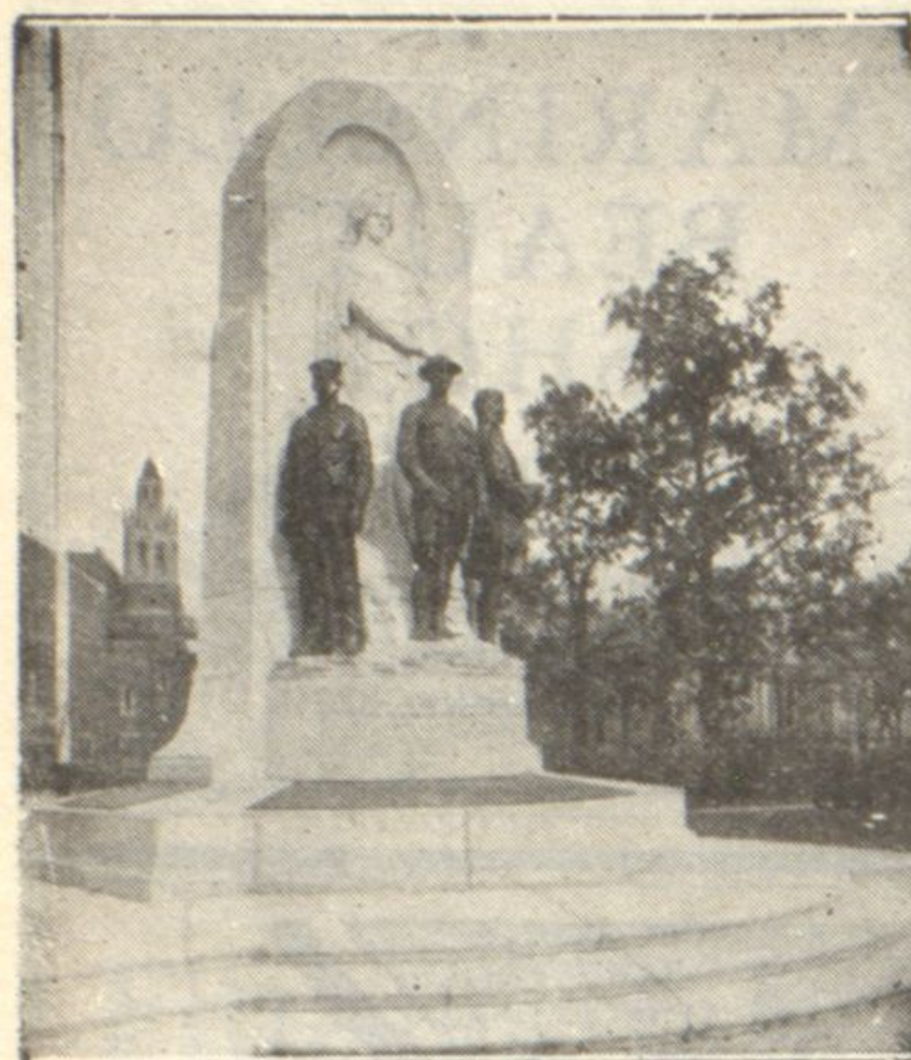
Our Newest Creation in Modern Memorials J. H. ANDERSON MONUMENT CO. 5751 Ravenswood Ave. Chicago, Illinois. Write for catalogue.