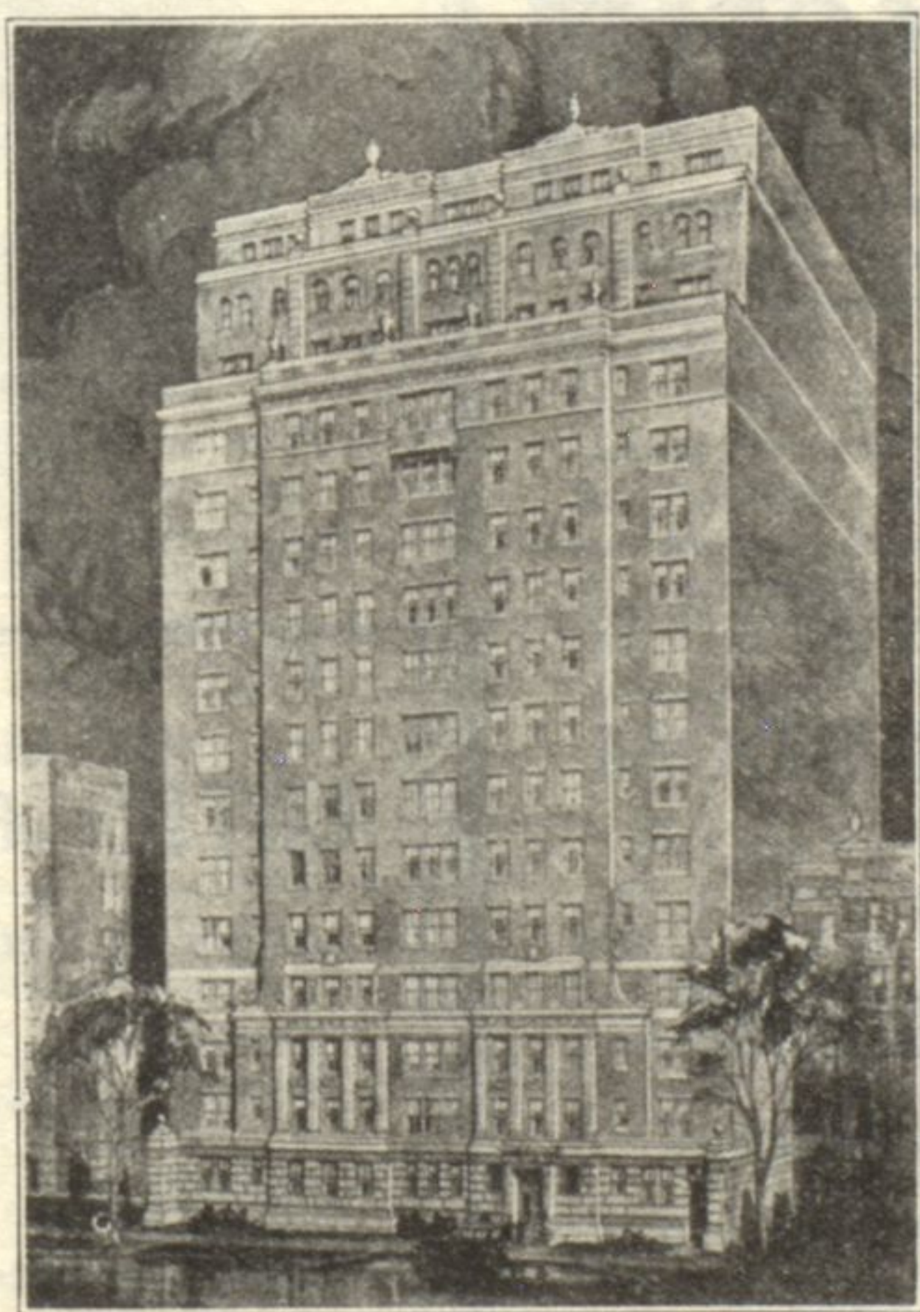
A sixteen story structure of Italian Renaissance Architecture. The equities average $18,000.00.

R ICHNESS without extravagance—a full measure of comfortable living at conservative cost—These and many other important advantages accrue to those who invest in Twelve Nine Astor Street apartment homes.