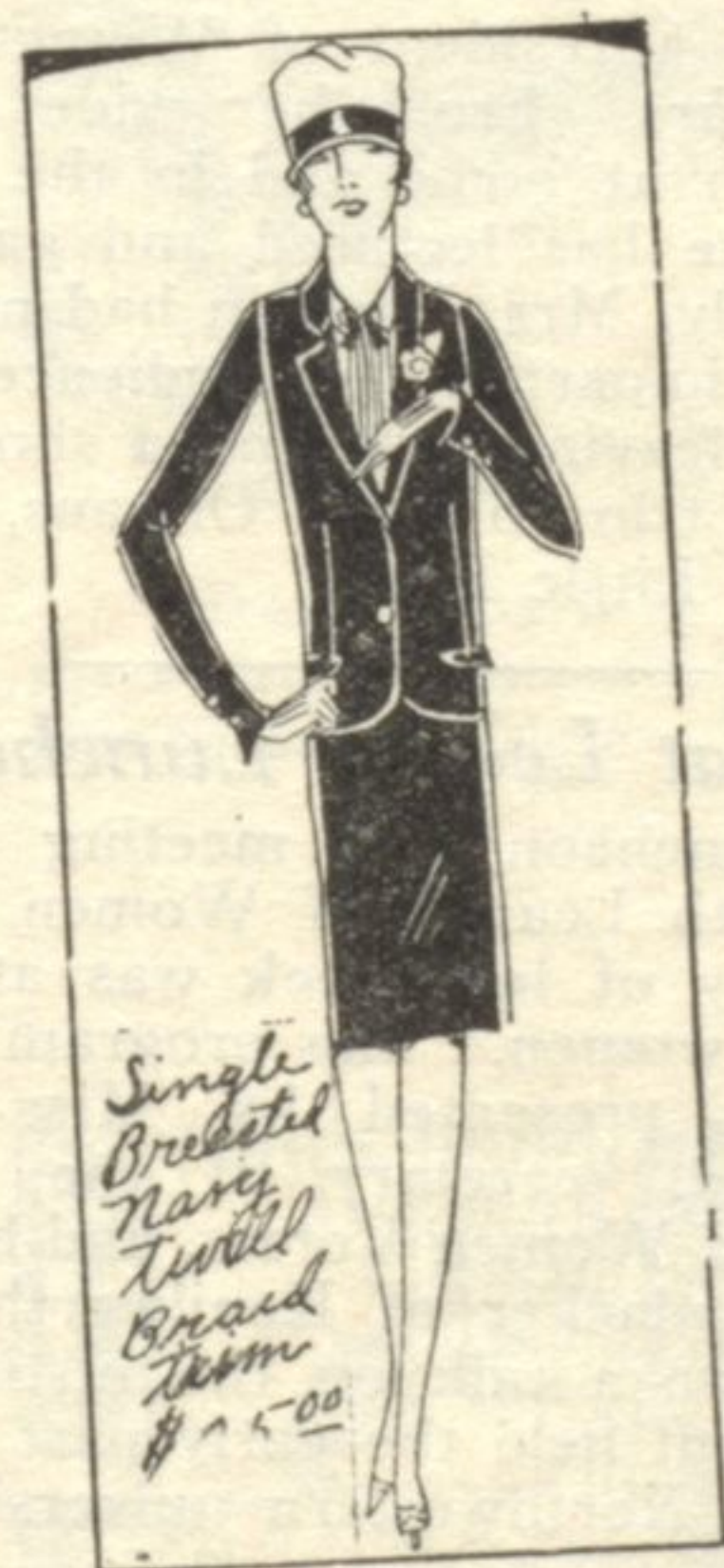
Single Breasted Navy Tweed Broad Skirt $15.00

It is Springtime at Rosenberg's. Enter into this North Shore store and let the new things at every turn greet you with their refreshing difference. Fashions are glorious in their newness. The spirit of THE NEW is the spirit of Rosenberg's. You feel it the moment you enter the door.