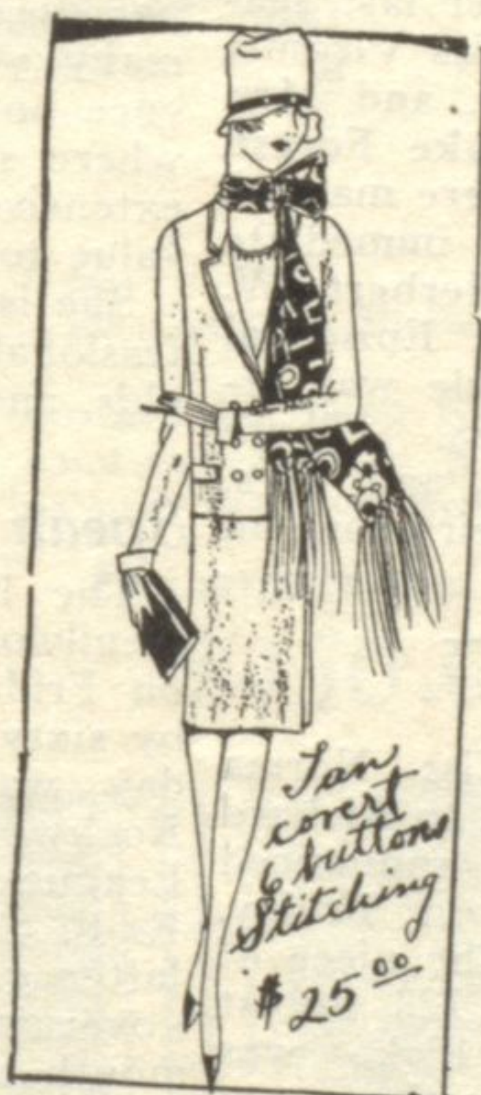
Tan coat 6 buttons stitching $25.00