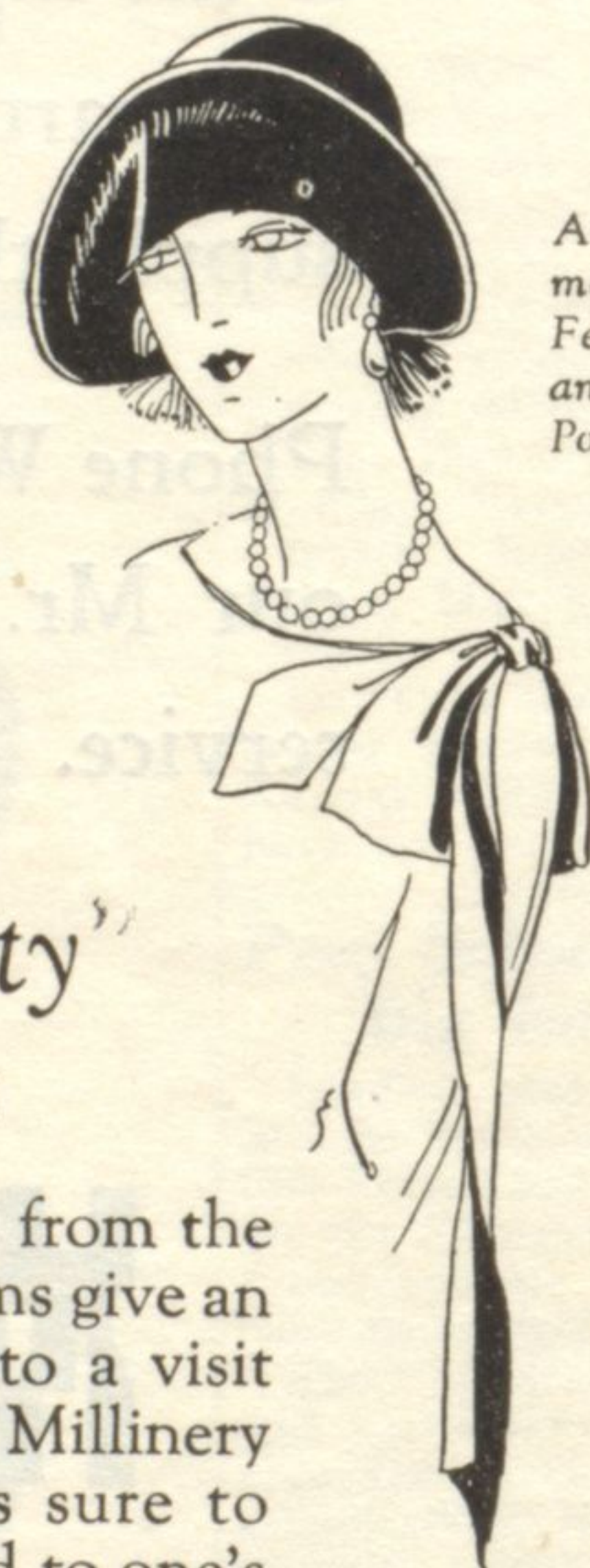
An "off-the-face" model in Black Felt with Black and White French Pom Poms.

The Washington Laundry 700-704 Washington Street EVANSTON, ILL. Phone WILMETTE 145