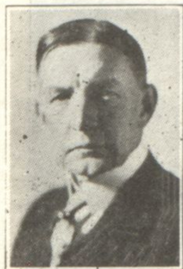
C. G. Dawes

An official reception and dinner at the presidential palace, Havana, Cuba, were items in the visit there last week of vice president Charles G. Dawes of Evanston and members of his party.